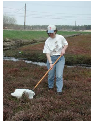
Using a sweep net to monitor for insects.

IPM could reduce pesticide residue in food and the environment and protect beneficial insects.