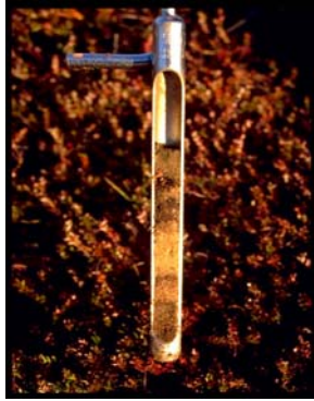
Soil core showing the alternating layers of sand and organic matter typical of a commercial cranberry farm.

both surveys, more than 85% of the sites had soil pH between 4 and 5. Soil pH tends to be lower in well-established bogs. The naturally low soil pH in Massachusetts cranberry bogs is maintained in part by the application of ammonium fertilizers and in part due to low alkalinity in local irrigation water sources.