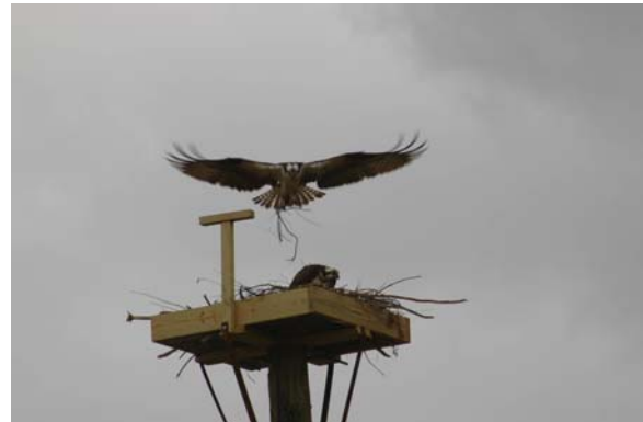
Osprey building a nest atop a pole erected next to a cranberry bog.

The diversity and abundance of wildlife species utilizing both wetland and upland habitats in the study areas were, in all probability, increased by their proximity to the reservoirs, cranberry beds, and disturbed areas of the cranberry operations. This edge effect contributed to ecological diversity. The value of habitats, particularly forested habitats, was improved for most wildlife species when they were adjacent to open areas.