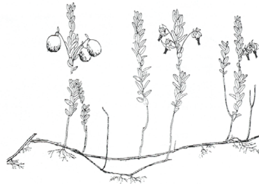
Diagram of the principle parts of the cranberry plant including vegetative uprights, uprights with flowers and fruits, and the woody runner to which the uprights are attached.

Botanical Description. Cranberry belongs to the Ericaceae or heath family, to which plants in the genera Rhododendron and Kalmia (laurels) also belong. Members of this family prefer acidic soils (pH 4-5) that are moist, well drained and high in organic matter (3-15%). The American or large-fruited cranberry, V. macrocarpon , is the most commonly cultivated cranberry. Its native range extends from Maine and the Atlantic Provinces to northern Illinois, and south to Tennessee (at high elevations).