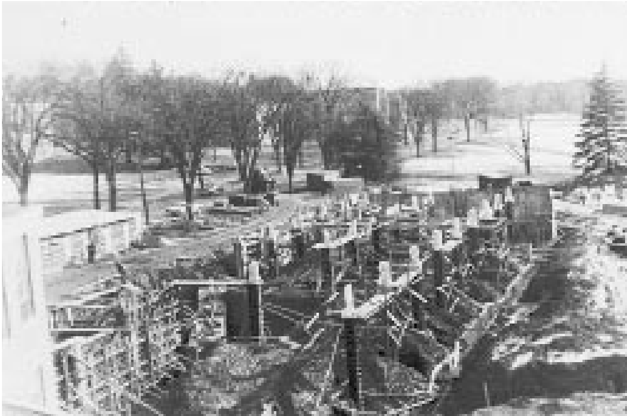
Construction of the Hasbrouck Addition, ~1962

Department of Physics Lederle GRC Tower Box 34525 University of Massachusetts Amherst, MA 01003-4525