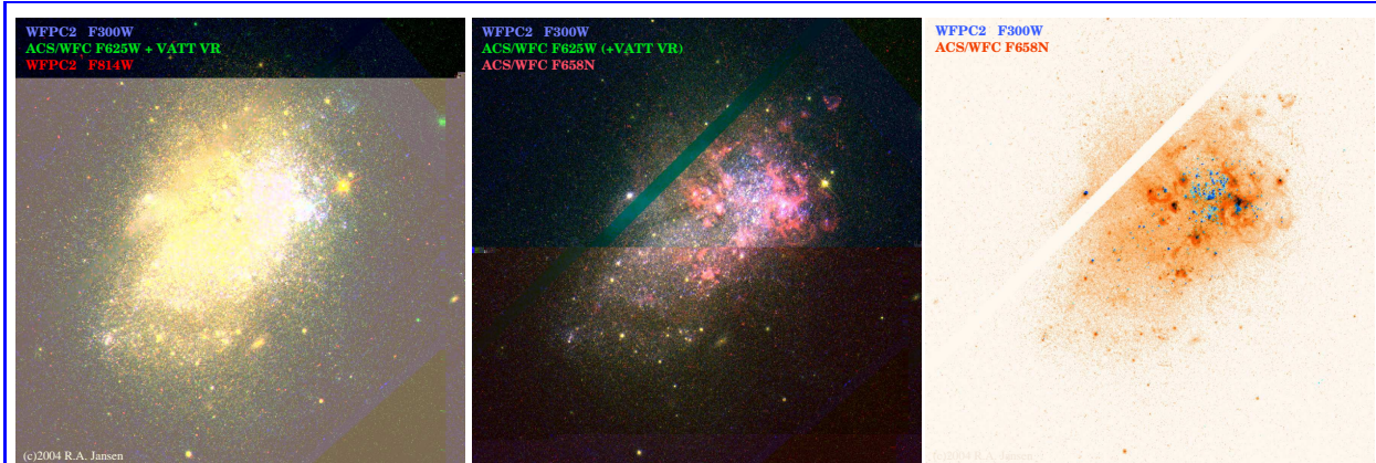
Fig. 1 — Three views of NGC 3738, a nearby Irregular galaxy, whose star formation history is characterized by episodes of vigorous star formation. (a) broad-band filters highlight the spatial distribution of stellar populations of various ages, (b) broad- and narrow-band images highlight the interplay between star formation and the ISM, the deposition of mechanical energy, (c) a mid-UV-H \alpha composite highlights the relation between the hot young stars that dominate the mid-UV and the ionized ISM. Various stages of the star-formation cycle, from deeply embedded and obscured star formation to cluster formation and break-out, can be identified. Whereas HST observations like these tend to be shallow and rarely provide simultaneous full coverage and <5 pc resolution, we here advocate a systematic study of the star formation histories and current massive star formation and its feedback within galaxies and their surrounding satellite galaxy systems, in cosmic environments as different as rich clusters, galaxy groups and void regions.

Color-magnitude and color-color diagrams obtained by HST and large ground-based telescopes of the resolved stellar populations within nearby galaxies enabled enormous leaps forward in our understanding of the stellar mass distributions and star-formation histories within our own and nearby ( D \lesssim 6 Mpc) galaxies. Pushing that capability out to 20 Mpc, with large fields of view sampled with sufficient sensitivity and sampled at linear scales <5 pc would provide access to galaxies within a large and varied number of galaxy groups as well as the nearest clusters (Ursa Major and Virgo).