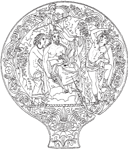
figure 2 – Engraved bronze mirror, from Arezzo, 350-325 B.C. Bologna, Museo Civico