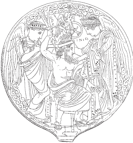
figure 3 – Engraved bronze mirror, from Palestrina, 400-350 B.C. London, British Museum

figures assume an integral function in the delivery process by acting as capable midwives, rather than passively witnessing or lauding the birth, as do Hera, Demeter, and the Eileithyiae of the Greek examples. Their interaction with the central pair diffuses the central focus which is characteristic of the Greek scenes, thereby encouraging the viewer's attention to roam the scene and the viewer to acknowledge a vital female contribution, possibly even a surrogate maternal element, to the realization of Athena's parturition.