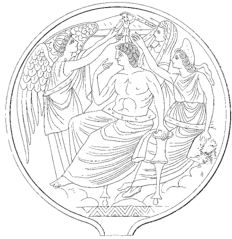
figure 4 – Engraved bronze mirror, third century B.C. Paris Louvre Br 1738

The interaction between Menrva and one or more of her female deliverers may be a consequence of her less intimidating demeanor, for while the Greek Athena seems to deter