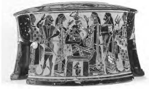
figure 1 – Attic black-figure tripod kotlion by the C Painter, from Thebes, 570-565 B.C. Paris, Louvre CA 616

The balance of the literary references to the birth is concerned almost exclusively with the moment of Athena's parturition. 6 On the details of the occasion, they concur: clad in full war regalia and brandishing a weapon, Athena vaulted from her father's brow. The Homeric Hymn 28 to Athena and Pindar's Olympian Ode 7 record a remarkable reception to this unprecedented occurrence, as the attendant Olympians are rapt and the universe trembles with awe. 7 Pindar, Euripides, and Apollodoros addi-