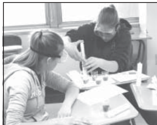
Additional information is online at www.umassk12.net/adventures

-Very interesting! Great activities! -Good to have the female assistants present. Good role modeling! -It is very important that young girls are exposed to math/science concepts early in their academic lives. This program shows the girls that science is fun and is also for them. -The hands-on aspects were excellent!