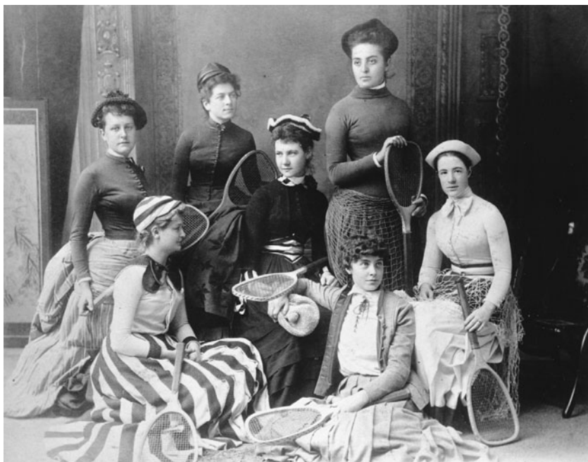
Wellesley College tennis players, Spring 1887. The two women center front wear loose bloused tops that contrast sharply with the tight basque bodices of the others. Note particularly the girl at the lower right: she forecasts the twentieth century—bare-headed, though clutching her tam, loose-sleeved, easy and relaxed—and the only one of the seven who does not wear a corset.

ley opened. It appeared at approximately the same time at Mount Holyoke, not for crew but for other outdoor activities. Clearly, it was an outfit for exercise, a gymnastic dress. It deserves mention here because it plays a twofold role. First, if it was a skirted dress with no trousers underneath, it sits somewhat precariously between the fashionable dress worn for sporting activities outdoors at the time and the truly athletic dress with trousers that women devised for gymnastic exercise indoors. Even though its loose top reflected Lewis's dictum, it really is neither one nor the other. Or it may have had trousers hidden underneath (see Cornelia Clapp's instructions for making a gymnastic suit in chapter 10). From this distance in time, we have no way of knowing for sure. Second, it provides the missing link that carries Lewis's unconfining baggy-topped dress into the twentieth century, to the new idea of sportswear. So the question is, why this dress, and why at Wellesley?