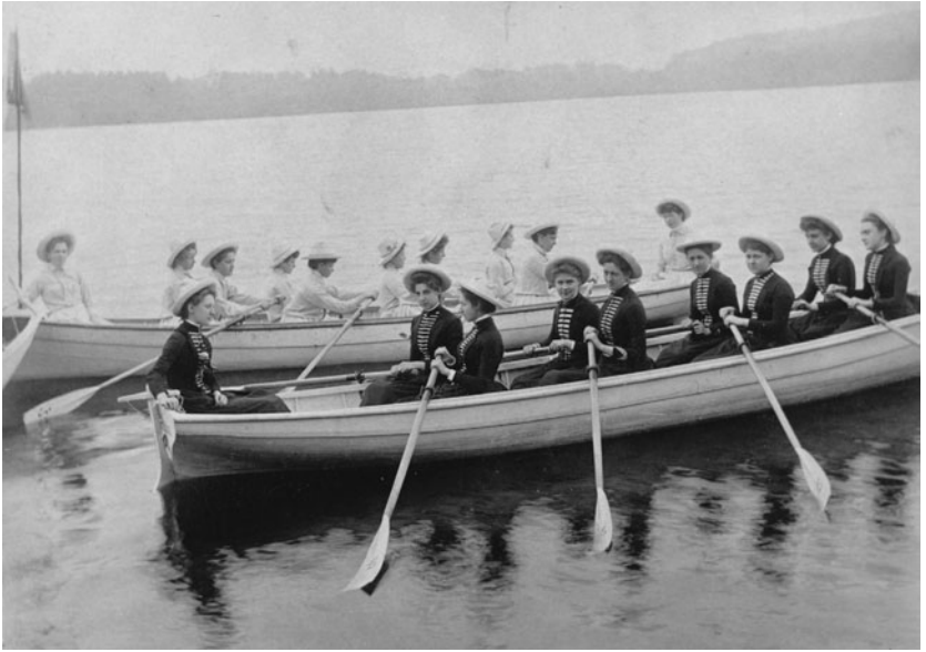
The Specials and Class of '87 crew. Note the corsetted basque bodices and the ensuing straight backs of the Class of '87, foreground, contrasting with the bloused tops and easier postures of the Specials behind them.