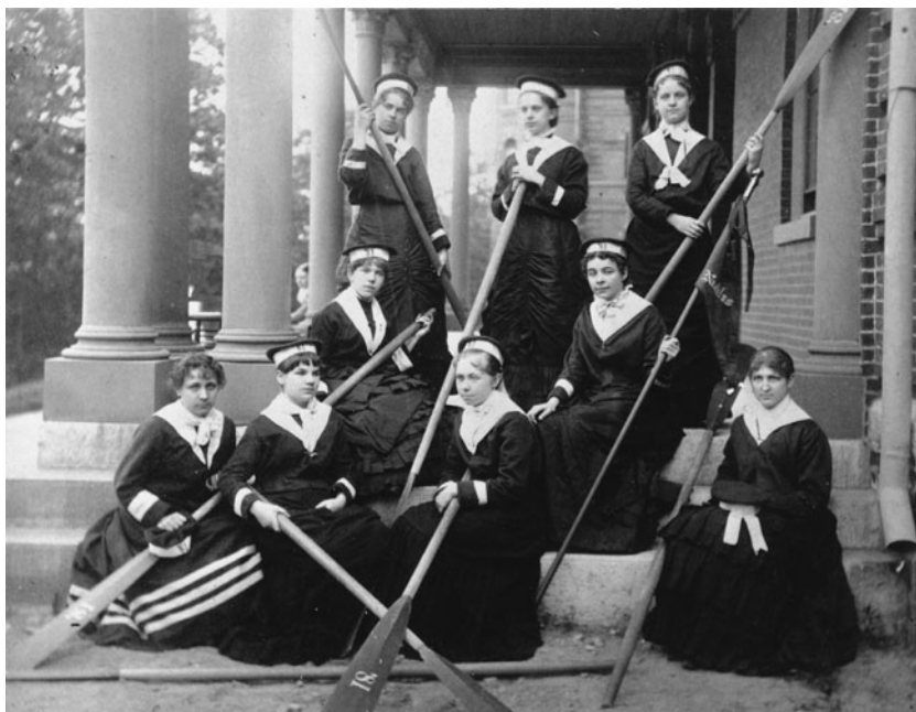
Crew of 1881. Hats, each with its identifying '81 on the band, and blouse shirts match, skirts do not.

impressive, less complete, and very likely less expensive than the upperclassmen's. They would consist of the same tops and hats, for example, but different skirts (depending on each girl's wardrobe), which barely showed below the gunwales of the boat when the wearer was seated to row.