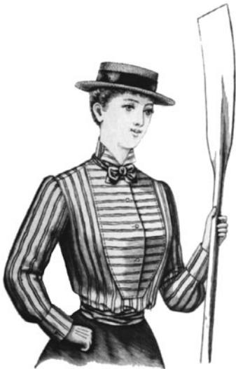
FIGURE No. 372 K.