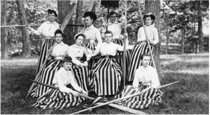
Freshman crew, wearing the popular stripes of the 1880s, 1889.