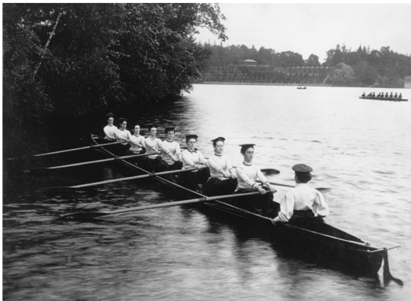
Class of '95 Freshman crew, 1892. Not only the new boats were streamlined, so were the uniforms by 1892.

dered with the name of the boat, Narcissus .” All three freshman crews went hatless, another first. Miss Hill “was heard to say that ‘they were the best freshman crew that had ever appeared on the lake.’” 25 In 1898 the clothing was not even mentioned in the newspaper accounts, and by the turn of the century, all the teams were wearing the regulation gym trousers and turtleneck or laced-front sweater.