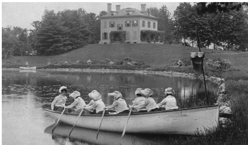
Crew of the Evangeline , one of the "tubs," 1884.

early years. Each year, the rowing activity culminated in Float Day (or Night), which led to a tradition at the college that lasted until 1948. A major annual event, it drew spectators from far and wide, with a special train bringing Bostonians to the campus as many as six or seven thousand at a time. 7 All visitors were invited personally, with hand-signed tickets to prevent the gate-crashing that proved to be a problem on occasion.