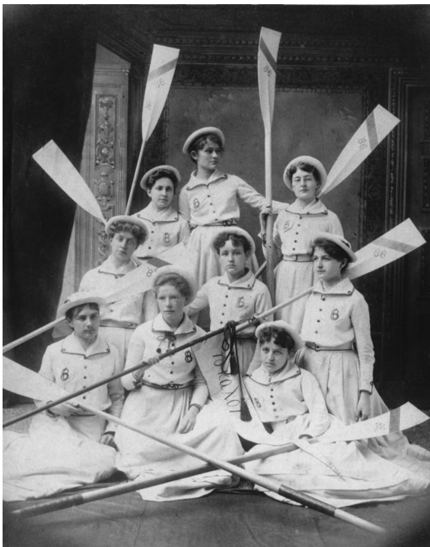
Class of '86 crew.

nology, “rolling collars”; the decoration depended on braid patterns and contrasting buttons, even, as in the class of '86 uniform, in the subtle positioning of the pockets. In the team photo, four members have pockets with a graphic “86” on the right breast and five have them on the left, a concession to the pairing of rowers on the boat’s wide seats. The embroidered pocket would be on the side most visible to the spectators. It was the hats,