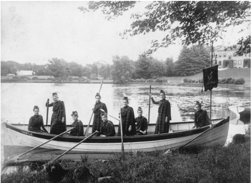
Miss Davidson's Freshman crew, resplendent in highland dress, 1889.