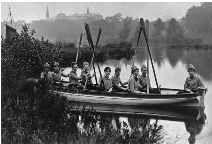
Crew of the Argo , 1879. Note the bloused shirts.

we see it here. The Delineator's winter catalogue (1888–89), in showing a ladies' yachting blouse, informs us that the style was “first published in June, 1883.” In the catalogue for autumn (1889), four pattern illustrations for sports blouses appear: two sailor blouses, another nautical-style blouse, and a “tennis shirt.” 1 Two have the corsetted silhouette of high fashion, but the other two are the baggy, unfitted “blouse shirt,” as The Delineator calls them. It is these “sport blouses” that form the basis of the outfits that I focus on in this chapter—the crew uniforms at Wellesley from the 1870s to 1892.