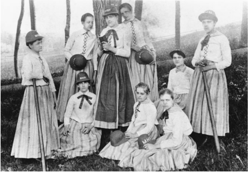
The Mount Holyoke Nines, about 1886. The uniform for baseball at Mount Holyoke echoes the crew blouse and skirt at Wellesley.

of the day. They represent the earliest continuous use of uniforms for a single sport worn by collegiate women in the United States. Mount Holyoke College students had formed a baseball team sometime around 1886 or 1887 (and, interestingly, wore a costume, complete with laced jersey sport top and striped skirt, very similar to the crew outfits at Wellesley in those same years). 26 Other colleges also formed baseball teams for women at that time, quite likely also adopting a simple gathered skirt and loose top. As early as the 1860s, Vassar had designed its own gymnastic dress in gray with red trim, but it was used for exercise in the gymnasium only, not as a sport uniform.