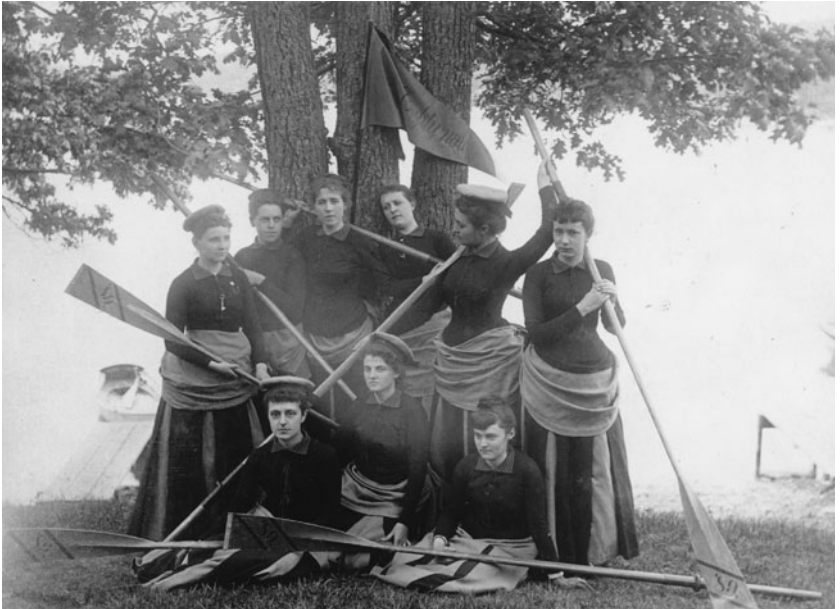
Class of '89 Senior crew succumbs to fashion.