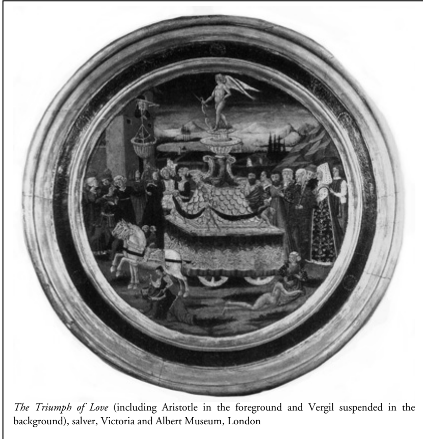
The Triumph of Love (including Aristotle in the foreground and Vergil suspended in the background), salver, Victoria and Albert Museum, London