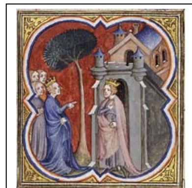
Solomon and the Queen of Sheba, from the Petrus Comestor Bible Historiale , ms 10 B 23, Museum Meermanno-Westree-nianum, The Hague

In addition to Dante, other figures were frequently cited in Trecento treatments of the sin as well. Particularly remark-