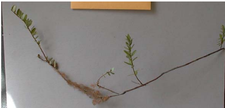
Cranberry runners, uprights and fine fibrous roots

Commercially, cranberries are grown in either organic soils modified by surface application of sand, or in mineral soils. On most Massachusetts cranberry bogs, the rooting zone typically contains about 95% sand -- the average organic matter in the surface horizon is less than 3.5% and silt and clay make up less than 3% of the soil. Therefore, the root zone of a cranberry bog has low cation exchange capacity: little ability to hold positively charged nutrients such as ammonium, potassium, magnesium, and calcium. This can present horticultural and environmental challenges. On the horticultural side, it is important to retain nutrients in the root zone where they can be taken up by the plants. On the environmental side, the layered structure of cranberry soils attenuates the downward leaching of nutrients. Layers of sand are added to the bogs every 2-5 years leading to alternating sandy and organic layers. The organic layers, comprised of decaying roots and leaves, have the capacity to hold nutrients. Leaching is further minimized if the subsoil is highly organic, as in a peat-based bog. These characteristics protect the ground water, but growers must still guard against movement of nutrients into surface water.