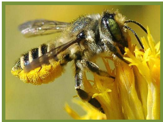
Figure 5. A Megachilidae leafcutter bee. Note that pollen is pressed onto stout hairs on the abdomen's underside.

Leafcutter bees (Family Megachilidae) are also found and are medium-sized native bees. Pollen is carried on the underside of the abdomen, as shown below.