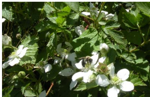
Figure 6. Andrenid on flowers at edge of bog upland

Nesting areas for the many of the solitary bee species are well-drained or sloping ground sites that are free of plants or have patchy areas of bare ground. Others nest in dead/dying trees or rotting logs, particularly in abandoned beetle tunnels.