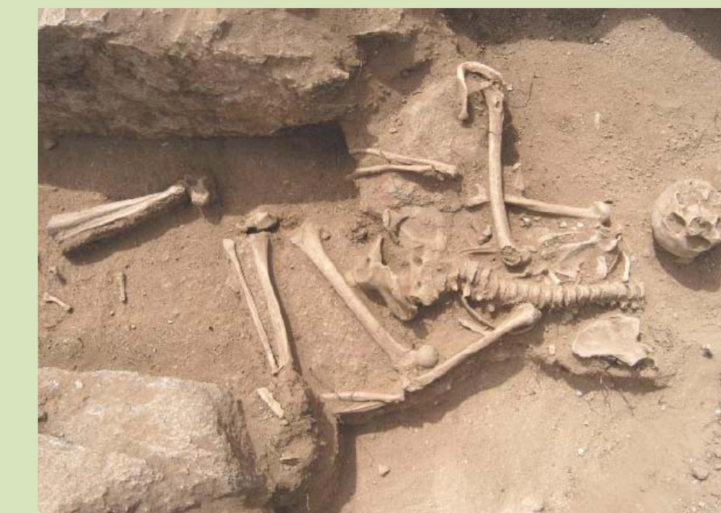
Mounds 8 and 46 = 2/23 (both had disturbed capstones)