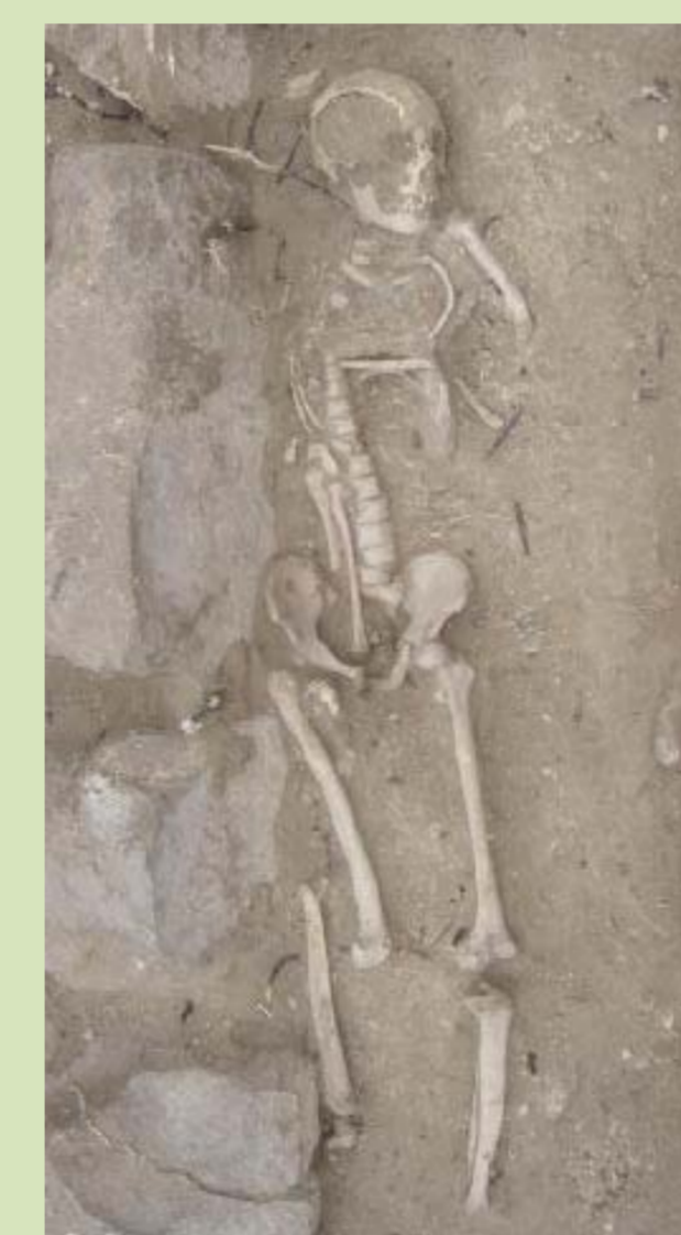
Mound 8,9,10,16,17,23,25,41,46 = 10/23 (3 without some animal disturbance)