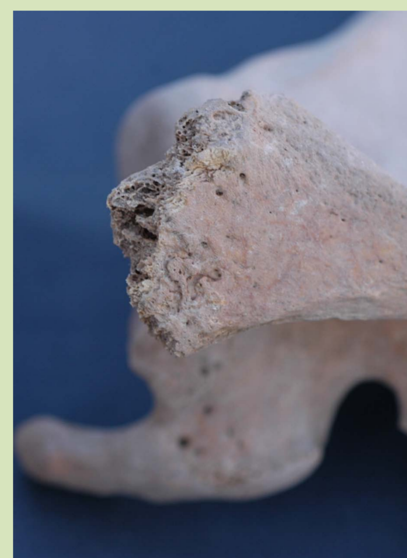
Mounds 8,10,17,25 = 4/23 [includes one without capstones]