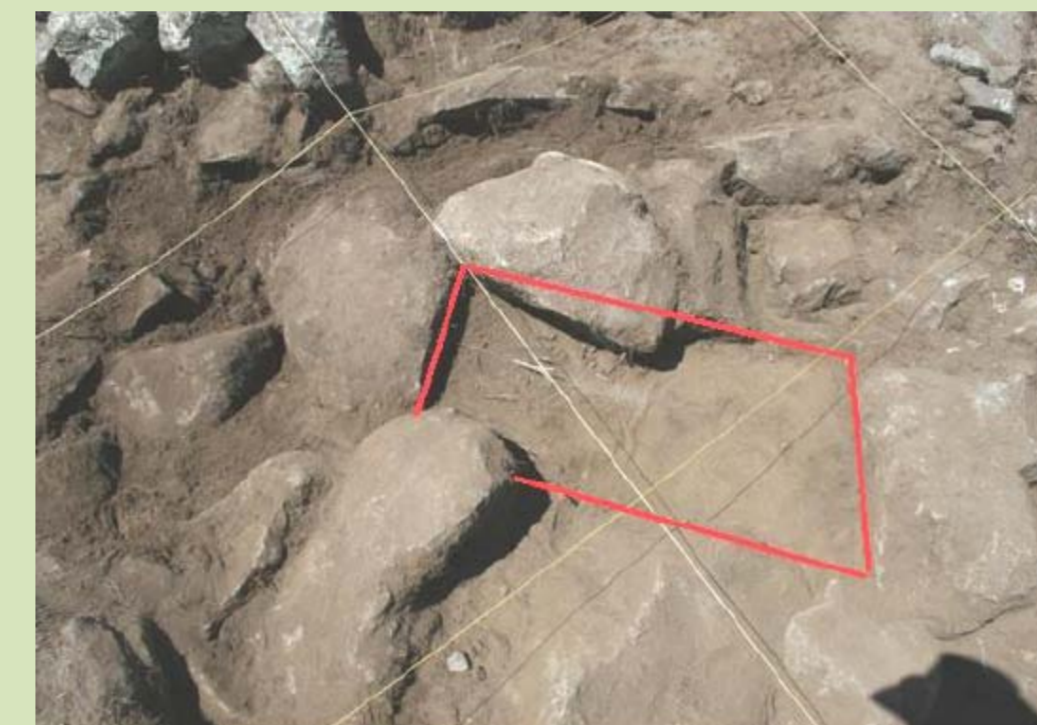
Mounds 8,16,41,27, 44,46 = 6/23