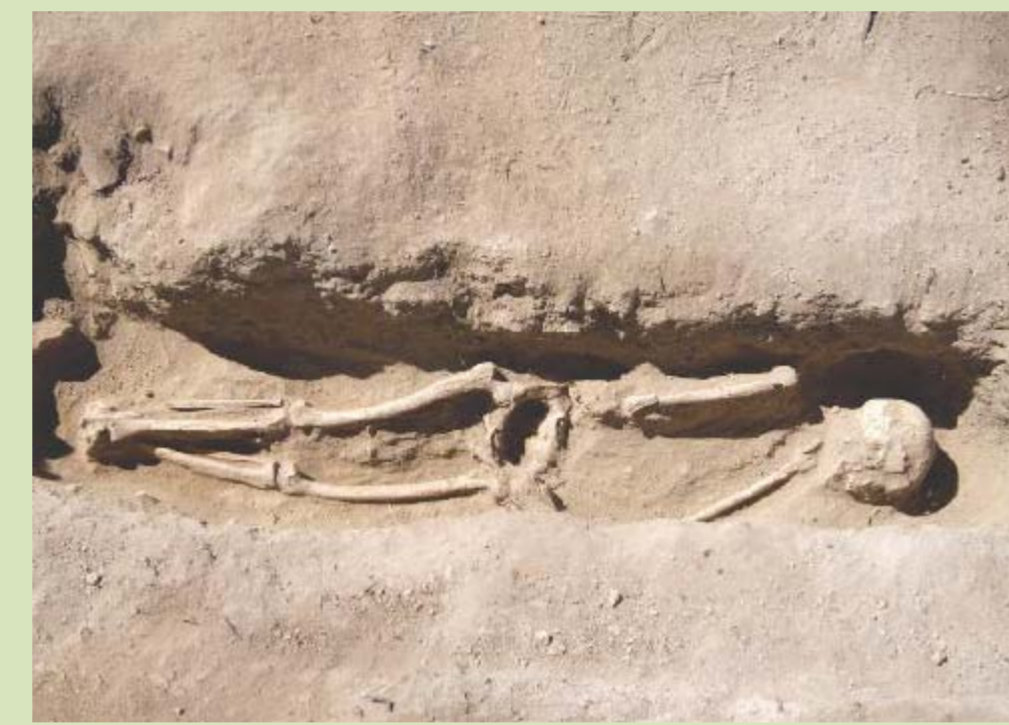
Mounds 12,18,24 = 3/23