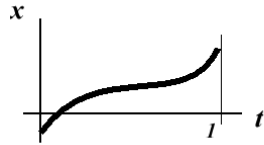
Figure 1. Example of optimal wealth distribution for a < 1 .

In part [c] the last result means that there is no optimal distribution that satisfies (3) and the despot can do no better than give all wealth to one individual.