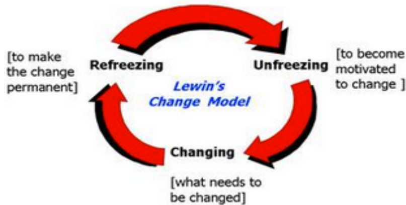
Figure 2. Kurt Lewin's change theory model. This figure illustrates the three elements of change. The unfreezing stage is about reducing the forces that maintain the current state and preparing for change. The changing or transitioning stage is developing new behaviors, values, or attitudes and moving to a new change or way. The refreezing stage is the final stage of crystallizing and the adaptation of a new process so that it can become a part of the present and future system.

Figure 1. The Shannon-Weaver model of communication. This figure illustrates the six elements of communication from this model. An information source produces a message. A transmitter encodes the message into signals. A channel are where signals are adapted for transmission. A receiver decodes the message from the signal. A destination is where the message arrives. A noise is any interference with the message travelling along the channel.