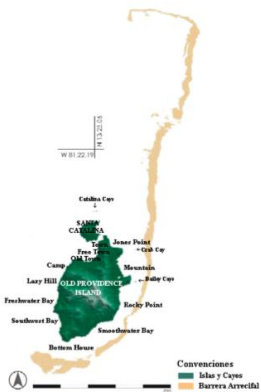
Map 2. Old Providence Island and the Coral reef barrier.