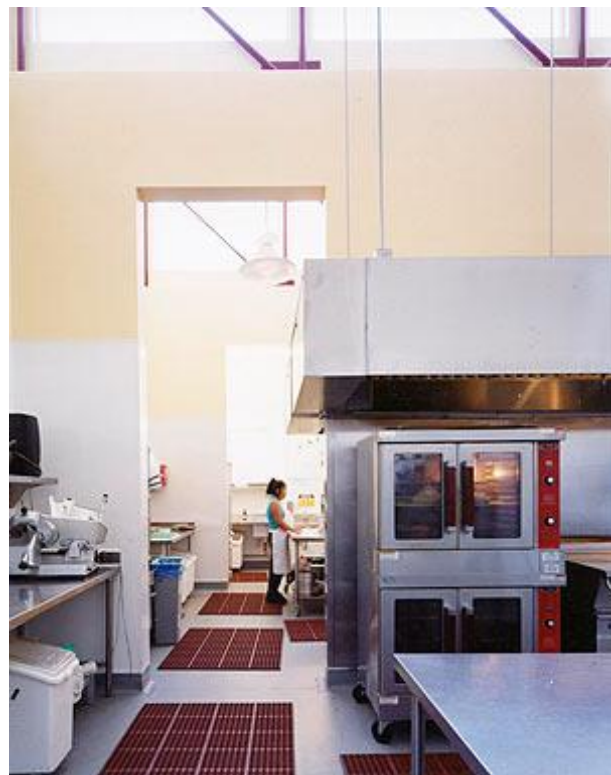
Figure 1 - Incubator Kitchen interior at La Cocina, San Francisco

Incubator Kitchens are an economic development model gaining in recognition nationwide as their success in growing small businesses is proven. Their most basic function is to provide affordable access to a commercial kitchen that is certified to meet all food safety regulations, allowing entrepreneurs to develop a culinary business without taking on the costs involved in developing a certified facility. While informal economies around food are often quite successful, food safety regulation limit their scale and prevent advertising or other forms of publicity, and also entail a degree of legal risk for the entrepreneur. Incubator Kitchens offer a way for