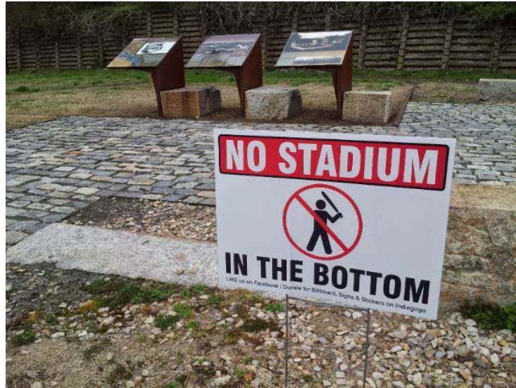
Image 1. Lumpkin's Jail" Archaeology Site, Shockoe Bottom: Protest and interpretive signage mark the site known by 19th century Blacks as the "devil's half-acre", April 8, 2014.

Most people in Richmond know that Virginia was long associated with slavery. Few, however, are aware of the central role the capital city played in that “peculiar institution.”