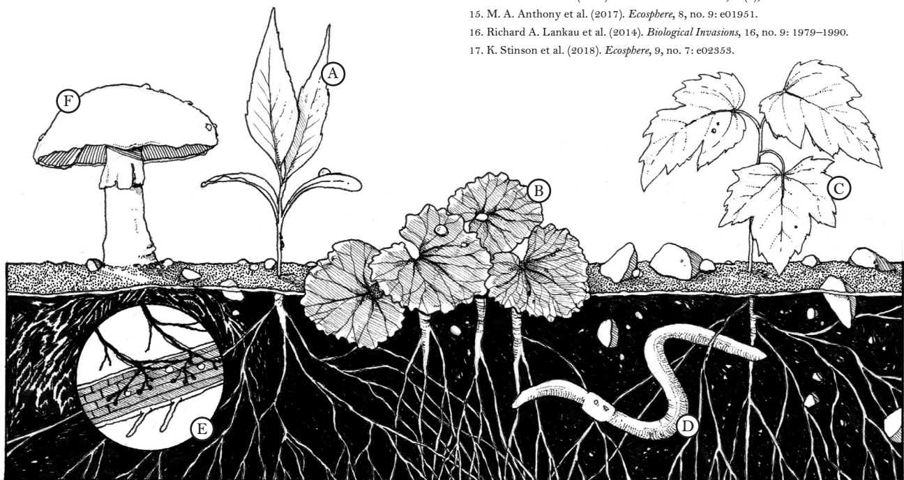
A. Ash ( Fraxinus americana ) seedling. B. Garlic mustard rosettes (first-year plants). C. Red maple ( Acer rubrum ) seedling. D. Non-native earthworm. E. Magnified ash seedling root and symbiotic mycorrhizal fungi interaction: fungal hyphae integrating into root through root hairs and forming arbuscules. F. Mycorrhizal fungus ( Amanita muscaria var. guessowii ).