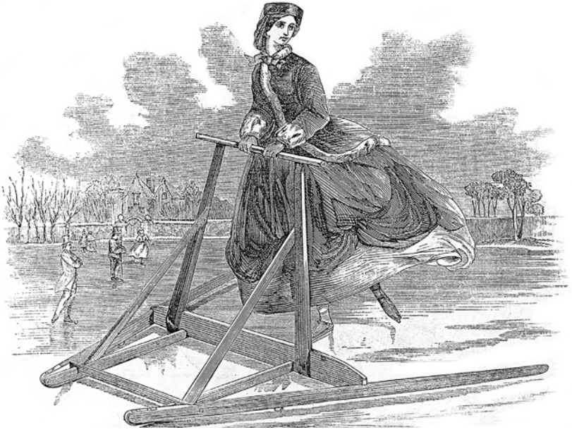
“Safety Skating Frame, for Beginners.” Note the hoop shaping the shortened elevated overskirt. Despite the voluminous layering, the lower body seems to be vulnerable to winter’s chill. Godey’s Lady’s Book , December 1863, 505.

“matter of curiosity to know how the Empress contrives always to appear with such well-setting skirts.” Her “well-starched flounces,” the writer sniffed, were “a costly contrivance, and. . .not suitable for those who take much walking exercise.” 29 Or skating exercise either, it would appear, in spite of her alleged fondness for the Suresne.