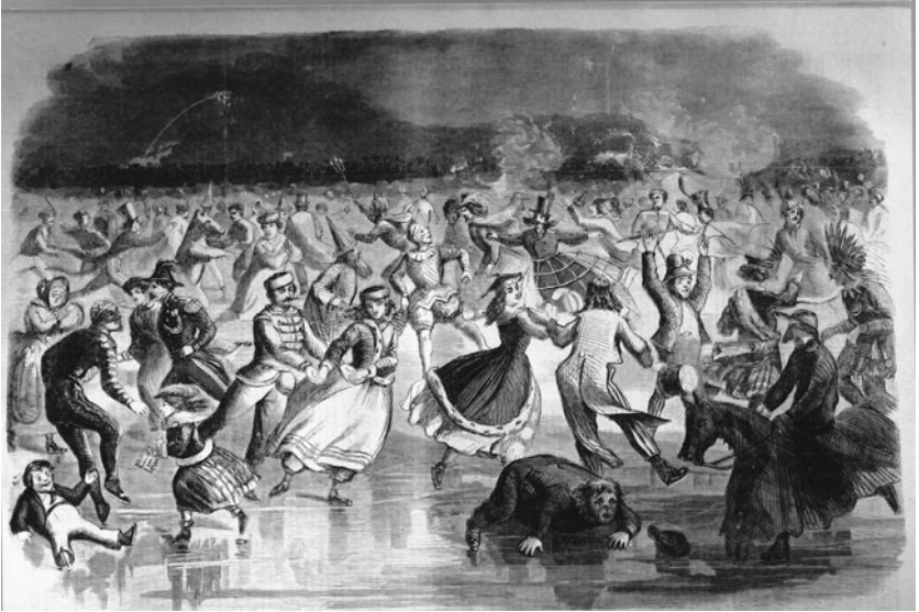
"Skating Carnival in Brooklyn, February 10, 1862." Note the woman of the central couple wearing bloomers under her skirt. Of all the people on the ice, she alone wears the "costume." Harper's Weekly , February 22, 1862, 125.

month, answers just the same purpose. The only advantage of the regular costume is, that there is less weight to carry, and it is certainly more effective. A long skirt is, of course, worn over a skating dress in going to and from the place of rendezvous. 53