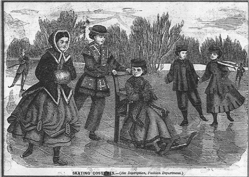
"Skating Costumes," 1869. Boys and girls enjoy the ice together. The one non-skater, perhaps a pre-learner, is pushed in a chair with runners. All are fashionably dressed, the girls in "short" skirts, modified to prevent tripping on their skates.

Another difficulty he encountered was that of finding "a sufficiently private place for learning." Here we discover the circumstances under which a young woman might participate in any new sporting activity, not just skating. We shall see these conditions reiterated again and again over the years, whether with swimming and bathing, bicycling, or any other sport. The author insists that women must learn away from the eyes of strangers, and if under the tutelage of a man, it must be a brother or close friend: "It is, for obvious reasons, very desirable that a lady's first day on the ice should be only in the company of some few friends upon a pond not frequented by others. . . . A brother or a friend, used to the ice" might accompany her. "Another reason why skating is not general among women," he asserts, "is a natural objection each one feels towards taking the first step. That is, the first step among her own circle of friends. A few, a very few, ladies do skate, and have done so now for many years." His exhortation concludes, "It is a great folly, to say nothing of the positive wrong, to narrow the straitened limit of out-door amusements in which ladies are privileged to indulge."