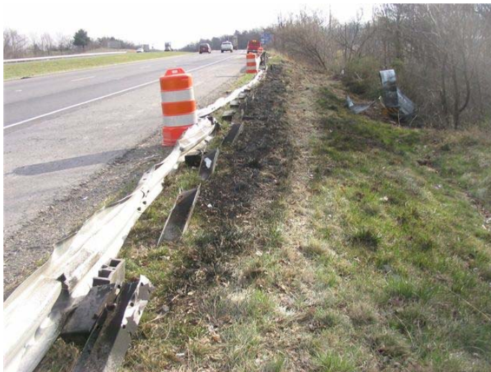
Figure 1. The accident site and the wreckage of the truck.

A tractor/trailer was involved in a highway accident, resulting in the release of approximately 100 gallons of diesel fuel from a ruptured saddle tank and ten gallons of motor oil from the truck engine. The wreckage ended at the bottom of the embankment, immediately adjacent the opening of the subsurface storm piping. Diesel fuel, released from the truck, flowed into soil immediate the wreckage and the open ditch. Several hundred feet of guardrail was destroyed in the accident, causing engine oil to disperse over approximately 100 feet of vegetation at the pavement edge. GEC Environmental Contracting Corp. (GEC) was contacted to provide clean up of the release. The wreckage and the site are seen in Figure 1.