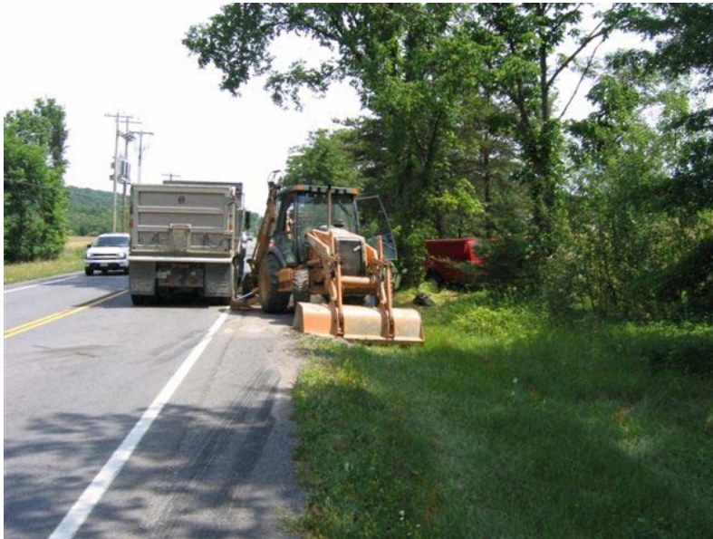
Figure 3. Accident site showing the asphalted road affected by spill.

A tractor/trailer was involved in a highway accident, resulting in the release of approximately 75 gallons of diesel fuel from a ruptured saddle tank. Free petroleum product flowed into the gravel road shoulder and adjacent embankment. The site is a single lane, north/south highway of typical asphalt paved construction (Figure 3). Road shoulders are intermittent gravel, grass, and embankments. Potential receptors are humans, wildlife, and groundwater. Multiple major underground communication utilities lines were present in the accident area making it difficult to excavate.