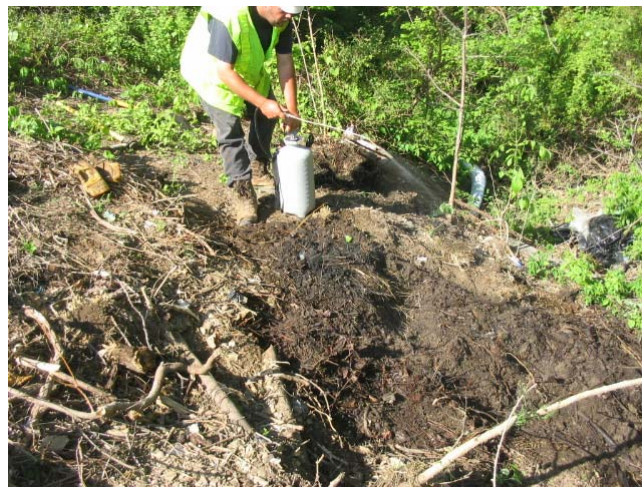
Figure 2. Application of AgroRemed to impacted soils

The conditions essential are the availability of moisture and easy permeability in soil. AgroRemed has cleaned up petroleum contaminated soils even with a history of contaminant more than 10 years. Under availability of moist soil conditions, the bacteria in the product continue to consume hydrocarbons as long as the source of hydrocarbon is available. Minimum supervision is required after application to the soil and does not need periodical additions of nutrients or products. Addition of these microbes and natural attenuation would provide a practical and cost effective method with little or no post-restoration efforts. The diesel fuel release and surface staining caused by engine oil would both be addressed in this manor. Multiple applications were anticipated for significant decrease of petroleum content in the saturated area.