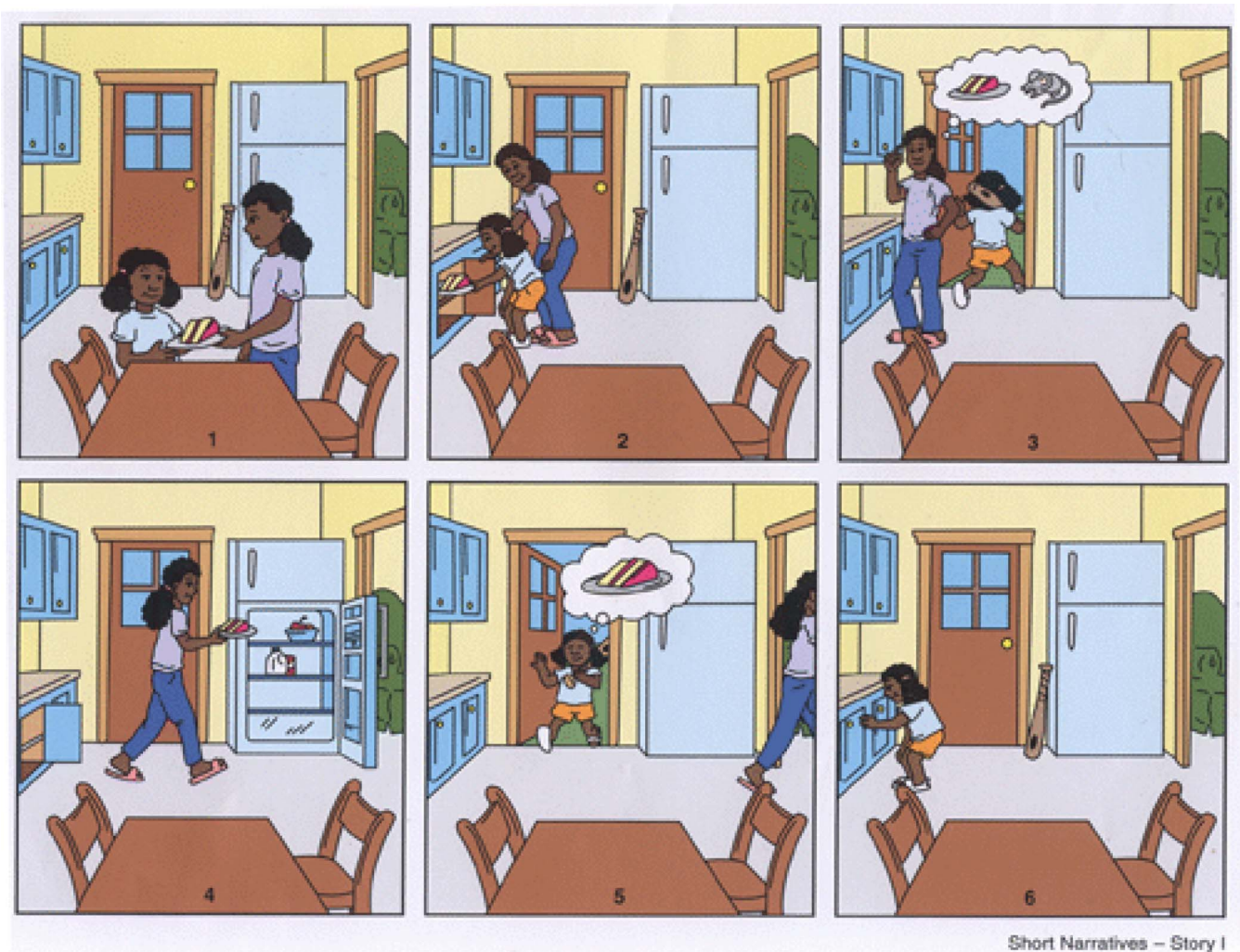
Figure 1. Sample six-picture narrative sequence from the Dialect-Sensitive Language Test (Seymour, Roeper, & de Villiers, 2000).

Note. Data analysis results from the Dialect-Sensitive Language Test. Copyright 2000 by NCS Pearson, Inc. Reproduced with permission. All rights reserved.