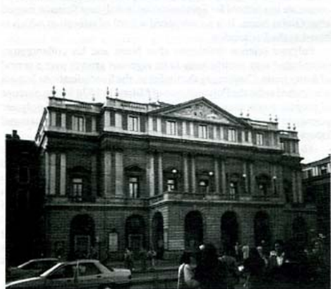
Opera of Milan, La Scala

A series of seminars on special topics are presented every year; the subjects are continually updated.