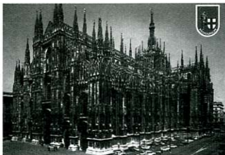
Milan, Il Duomo

facilities with different laser sources and a Cary 2400 spectrometer are also available. Photo-induced absorption measurements are also carried out; the laboratory is especially equipped to study the resonant Raman scattering of conjugated system.