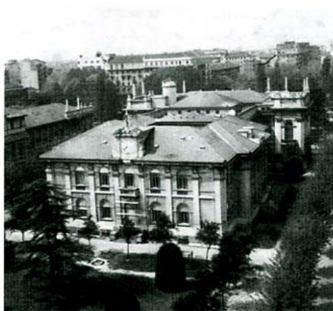
Advanced School of Polymer Science Politecnico di Milano