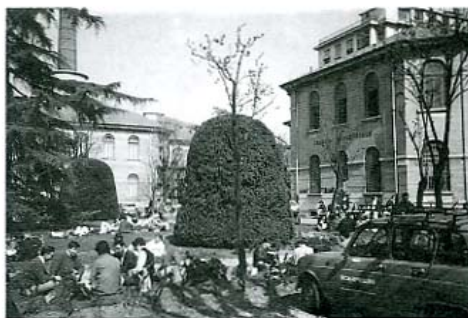
Students at the Politecnico

Another area of interest of Dr. Ferruti's group is the synthesis of end-functionalized oligomers to be used for preparing oligomeric derivatives of drugs and enzymes. In particular the following main lines of research are being followed: a) the introduction of original methods of reactive functions of already available oligomers, such as poly(ethylene glycols); and b) preparation of new end-functionalized oligomers of N-vinylpyrrolidinone and substituted acrylamides by radical polymerization in the presence of functional chain transfer agents. This chemical laboratory headed by Dr. Ferruti is equipped for polymer, as well as for organic synthesis, and has an FT-IR spectrometer, a U.V. spectrometer, viscosimetry measuring devices, a 1 H NMR spectrometer and a differential scanning calorimeter.