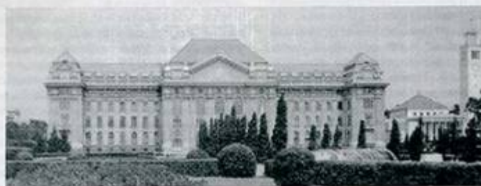
Kossuth Lajos University, Debrecen.