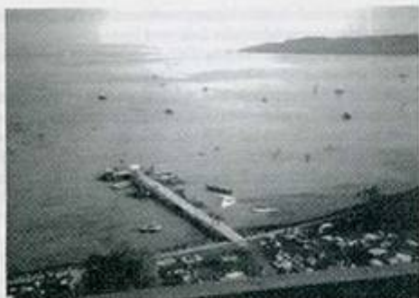
The scenic view of Lake Balaton.

the carbenium and oxonium ions in the chain growth of cyclic acetals was finally established. Surprisingly the carbenium ions are only 100 times more reactive at -78^{\circ}\text{C} than their oxonium counterparts. These findings have been used in analyzing the roles played by ligands in the polymerization of vinyl ethers. The nucleophilic centers are then located in both monomer molecules and polymer repeating units when external ligands are not added.