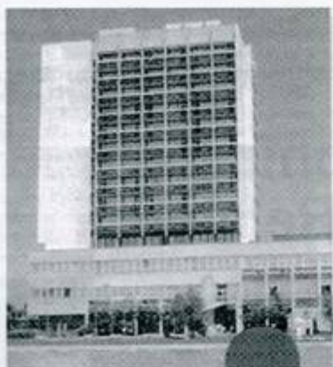
The Hotel Füred, Balatonfüred, Hungary, the site of the symposium.

approached. Answers to these questions were examined critically.