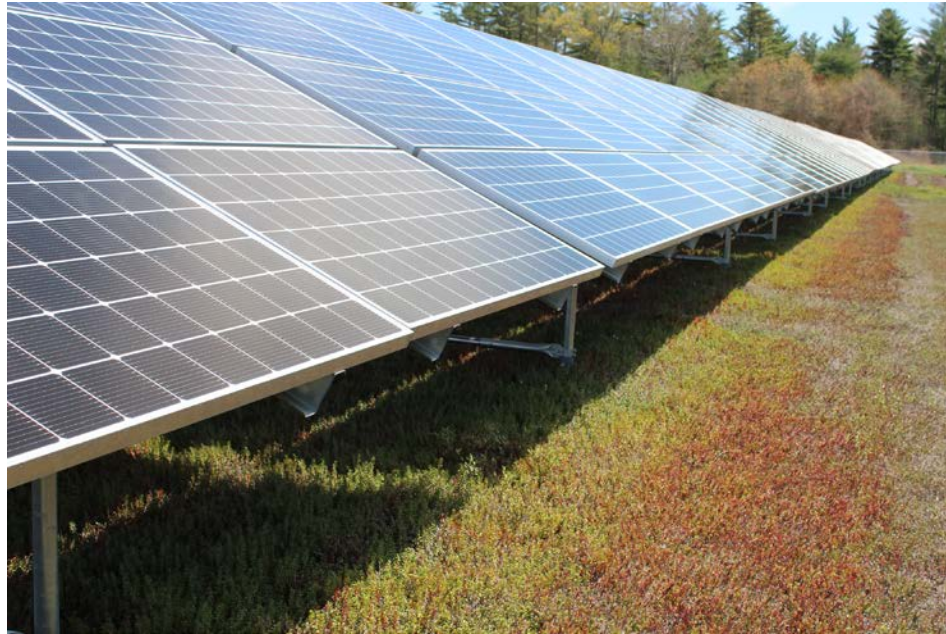
Figure 1. Cranberry vines growing under solar PV system in Carver, MA.

What is light saturation and why is it important? As light increases, the rate of photosynthesis also increases, but only up to a point. At the light saturation point, having access to more light no longer causes an increase in photosynthesis. In fact, at high levels of solar radiation, oversaturation of the leaf photosynthetic apparatus may result in a decrease in photosynthetic light use efficiency in a process referred to as photoinhibition. The lower the light saturation point in cranberry may increase the likelihood that the vines will do well in shaded conditions due to reduced photoinhibition.