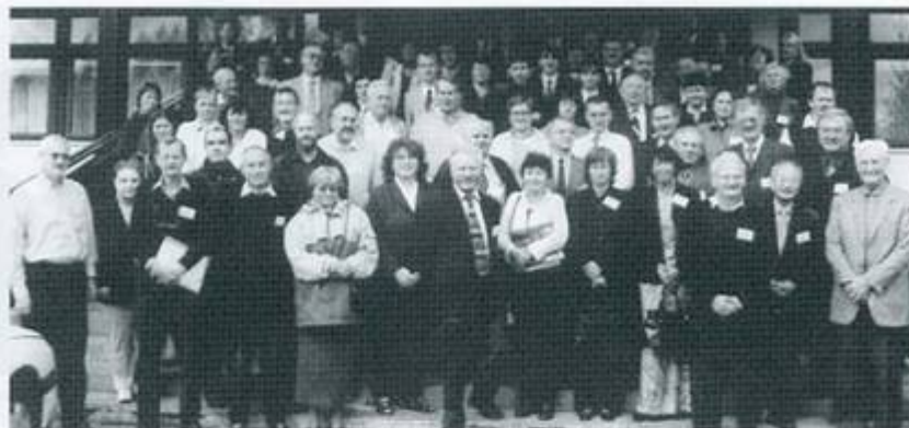
The participants of the conference.

publish an account of the last 10 years and the present status of the Polymer Institute and what is planned for the future.