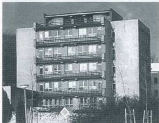
The Polymer Institute

The Polymer Institute has organized meetings and workshops in polymer science. Few events were organized during the dark times of the communist regime, but they have become more common in recent years. Most important are the Bratislava Interna-