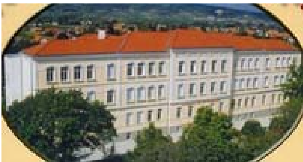
Elementary School, Traiskirchen (18);