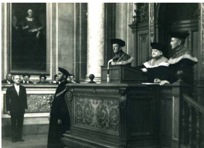
Doctoral Degree 1950 (43); meeting in Graz, 1950 (44)