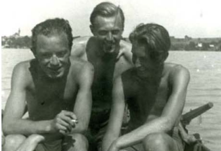
On a lake in Carinthia, 1947 (32)