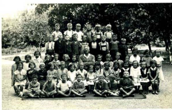
First grade in 1934 end of school year (20),