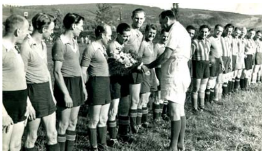
Soccer In Vienna ~1952 (59);