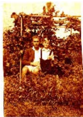
Artist drawing: Luydererstrasse, mid 1930's (11); OV with local boys, 1931 (12)