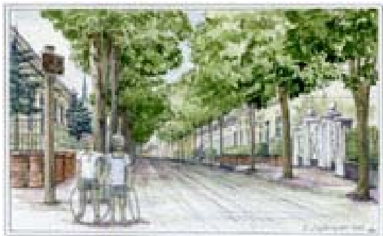
Karl Luydererstrasse, Traiskirchen (9): OV birthplace, Luydererstrasse #8, ~2000 (10)