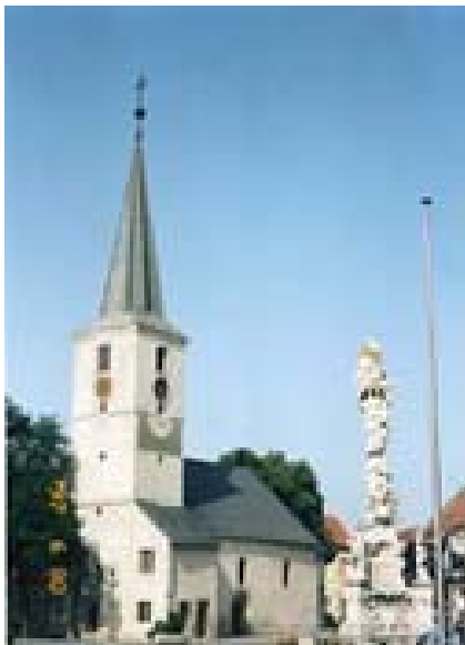
Church St, Nikolaus (16):