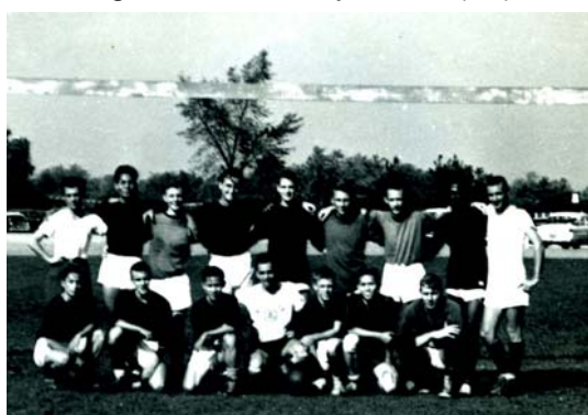
Soccer at the Univ. of Michigan in Ann Arbor: (63) as player in 1953; (64) as referee, in 1954