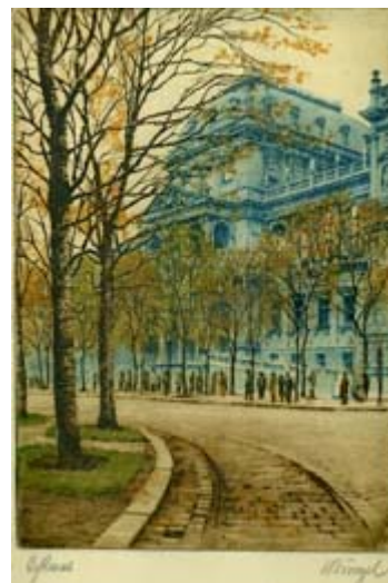
Main Building, Univ. of Vienna (42)