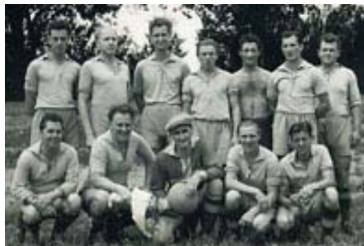
Another game near Vienna, ~1951 (60)