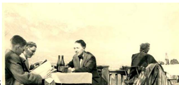
Vacation in the Mountains ~1951 (46)