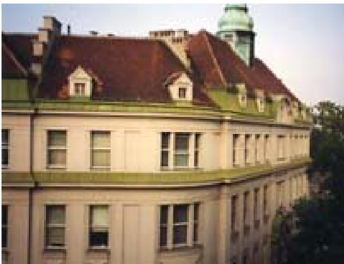
II. Chemical Institute, Vienna (41);