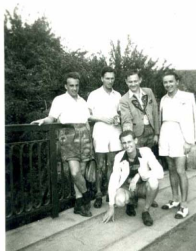
A group of friends at a chemistry