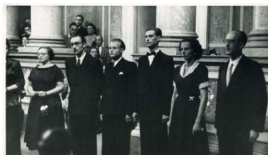
Promotion 1950 (45);