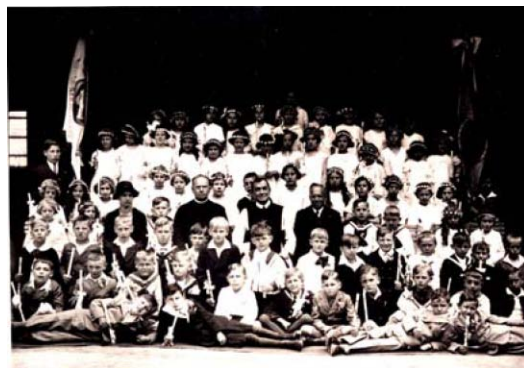
First grade, first communion (19)