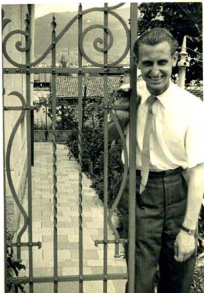
Some of the High School graduating class, 1944 (29); In the Mountains 1947 (30)