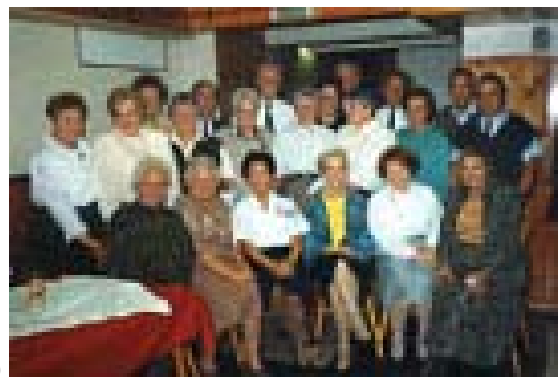
70 years later (21)