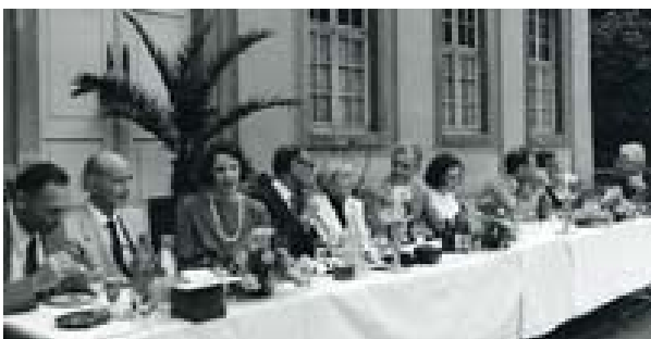
At meeting in Gaussig, Germany 1988 (156)