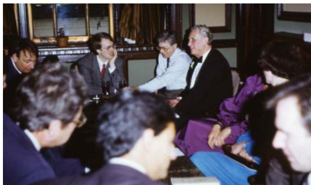
130 Informal meeting (130)