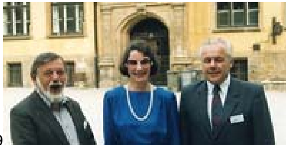
At the Gewandhaus, opening of the Symposium (159)