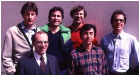
127 Grosso graduates (127)