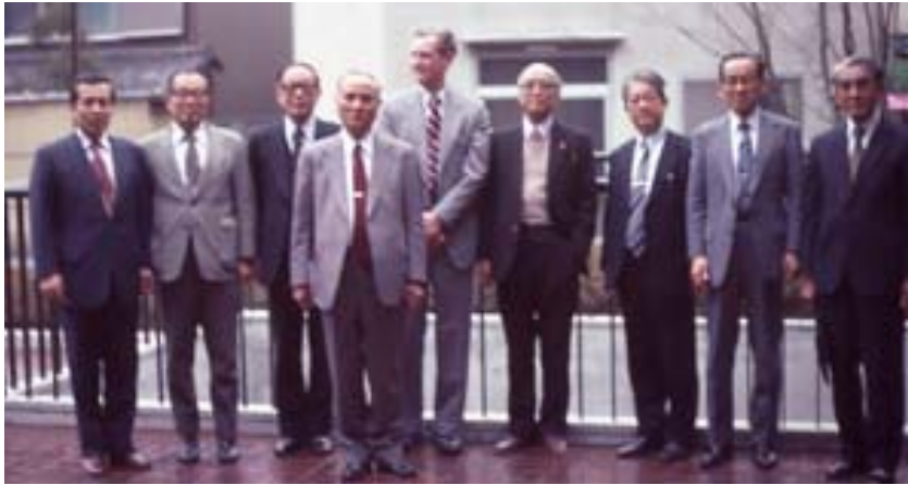
Faculty of Polymer Science at Kyoto University 1958 (177)