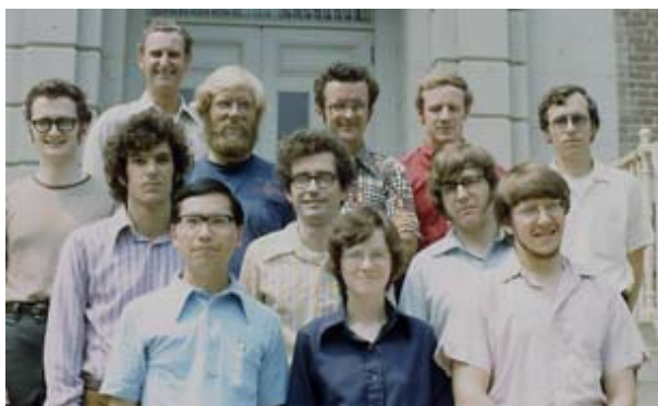
134 Early group, ~ 1973, (134),