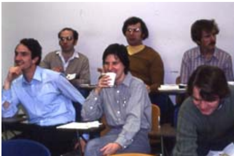
126 Group Seminar (126)