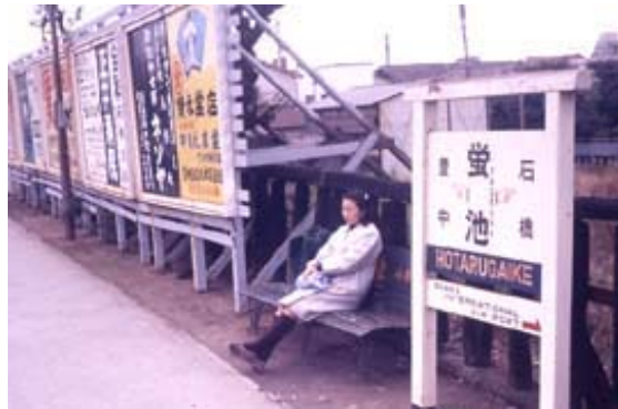
"My" Railroad Station for Osaka University (180)