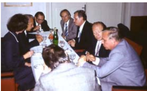
149 Chemistry Faculty in Jena (149)