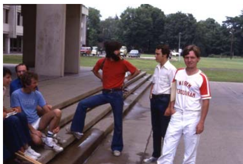
128 After the baseball practice (128)