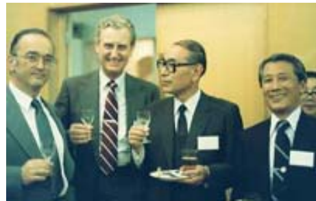
At a meeting in Japan (182)