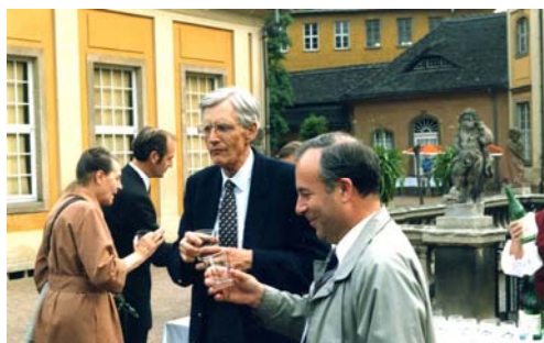
Banquet at IUPAC Symposium, Merseburg, 1987 (157)