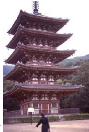
In Kyoto (178)