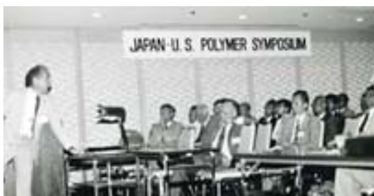
196 U.S.-Japan Meeting in Kyoto 1985 (196)