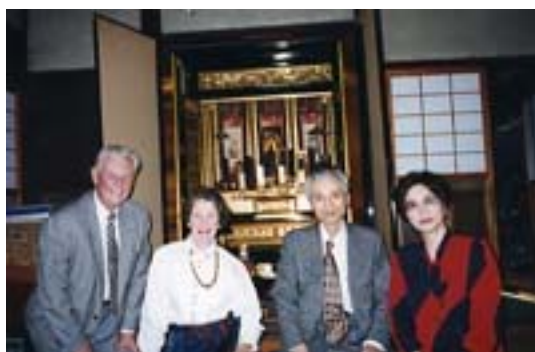
Hatada's family farm house in Habiikino.(206)