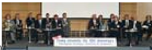
201 Osaka University 70 th Anniversary 2001 (201)