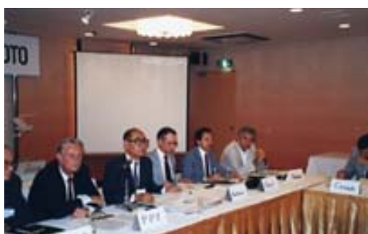
198 Council Meeting Polymer Summit (198)