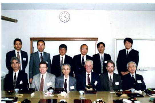
200 Osaka-Amherst Meeting (200)