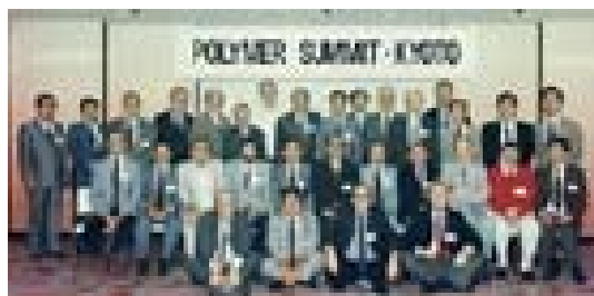
197 Polymer Summit, Kyoto 1988 (197)