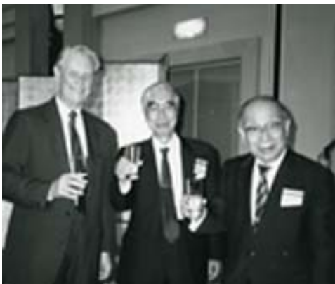
A visit to Mitsui in Chiba (211)