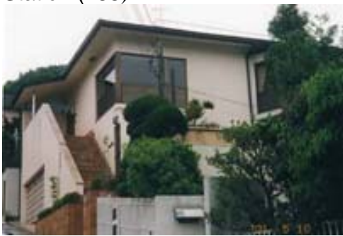
Leaving the house on Kaguragaoka (233) Entrance of the house (234) Leaving Kyoto Station (235)