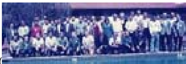
2 nd Japan-US Symposium Pingree Park, CO (192); 3 rd U.S.-Japan Symposium in Shin-Osaka, 1983 (193)