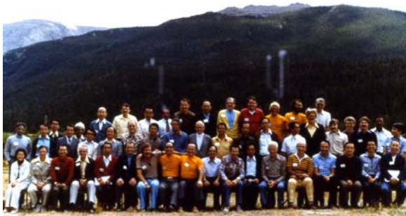
First US-Japan Symposium on Polymer Synthesis (190) in Mountain View Hotel. Hakone-Kawaguchi-ko Japan 1972 (191);