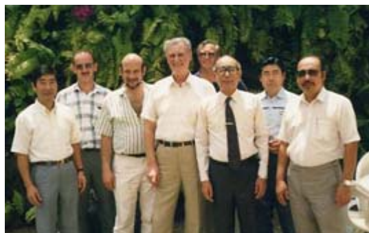
PPF preparation in Australia (277)