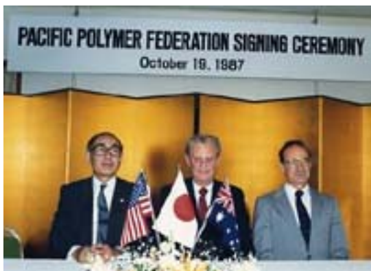
The three founders of PPF (274)