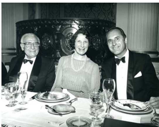
OV with Linus Pauling (297)