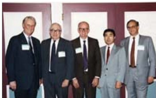
Key speakers at PPC-1 (279)