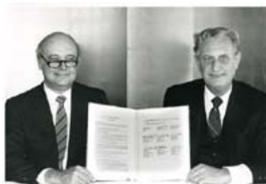
Signatories of ACS Polymer Division (275)