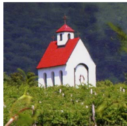
Ursinus Kapelle (354)