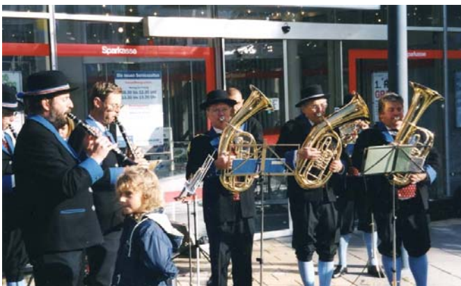
The City band (353)