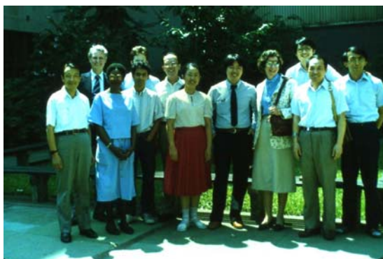
Our group on Jay Street (331)