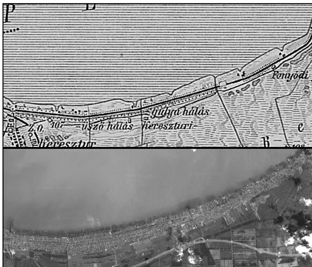
Figure 2. The west side of the southern lakeside between Balatonkeresztúr and Fonyód on the third military map and on the Google Map

After the filoxera destroyed the vineyards of Zala Hills, the landlord family of this area, the Széchenyis established new vineyards on the sandy soil. The first buildings had been built according to this successful project. Some families let their villas to visitors in the summer, this was the first step for Balatonmárfürdő towards evolving into a holiday resort. The area became an independent administrative unit in 1926. The first hotel was established in the middle of the 1930's, but there were cheaper accommodations as well. The viniculture dominated till the 1970's. ( www.balatonmariafurdo.hu , 2008) Today 88% of the buildings are weekend houses, the settlement has a long, rectangular form along the lakeside, with connection to the houses of Balatonkeresztúr and Balatonfenyves as well. (If we