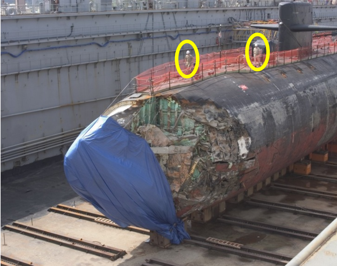
Fig. 1. Photograph of the USS San Francisco in dry dock after the accident. Note the men walking within the orange, gated area on top of the submarine for scale.