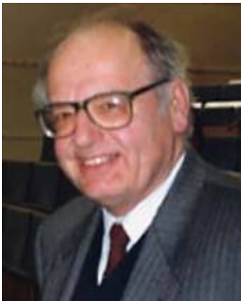
Eschenmoser, Albert Zurich, Switzerland