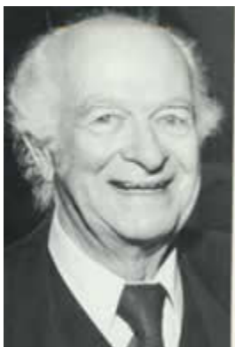
Pauling, Linus Pasadena, CA