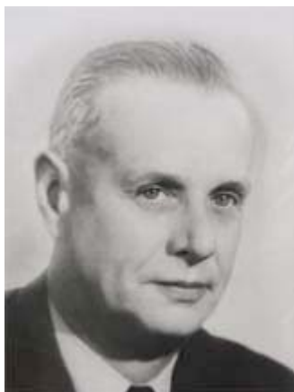
Sadron, Charles Strasbourg, France