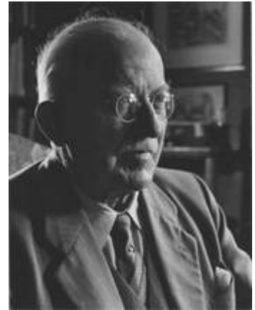
Staudinger, Hermann Freiburg, Germany