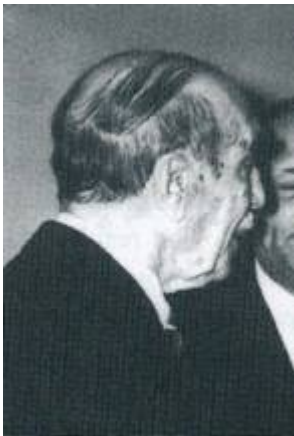
Semenov, Nikolai Nikolaevich Moscow, Russia