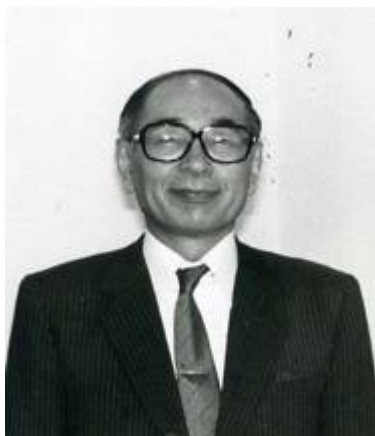
Saegusa, Takeo Kyoto, Japan Polymer News 20(3), 85 (1995)