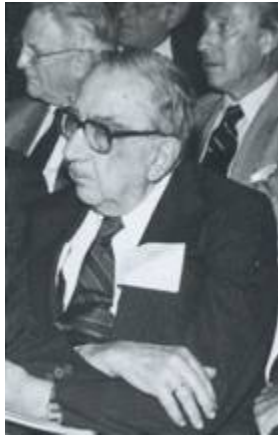
Teller, Edward Berkeley, CA