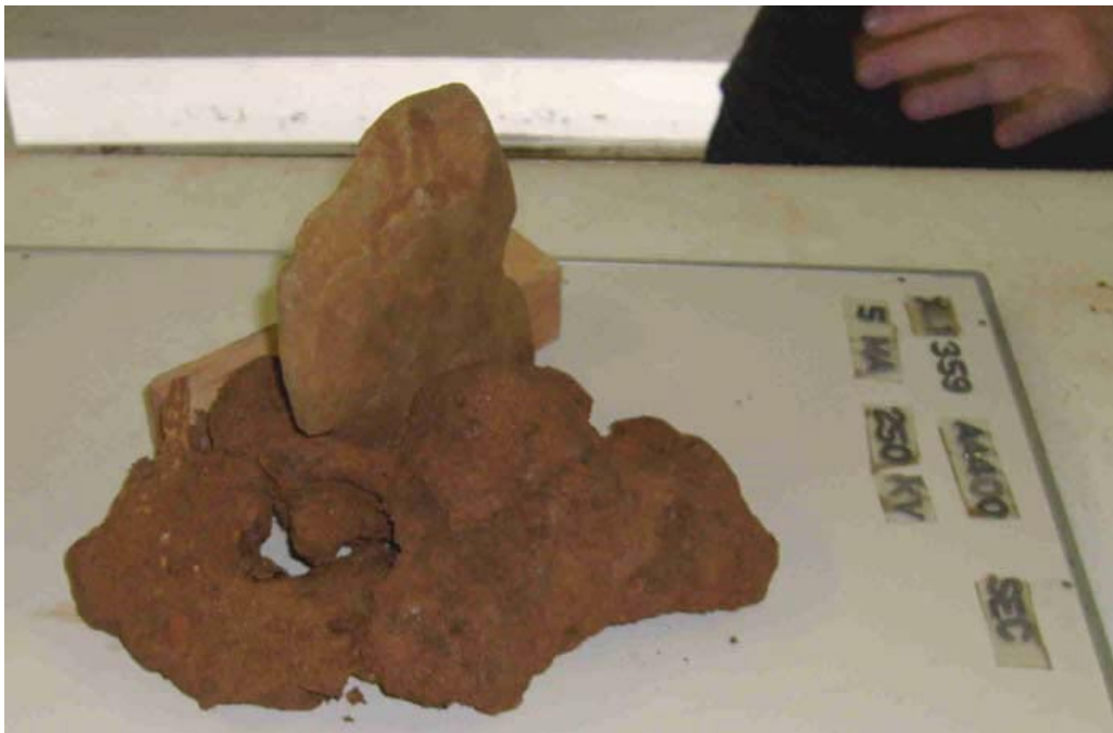
Figure 5. View of the bundle from another angle.