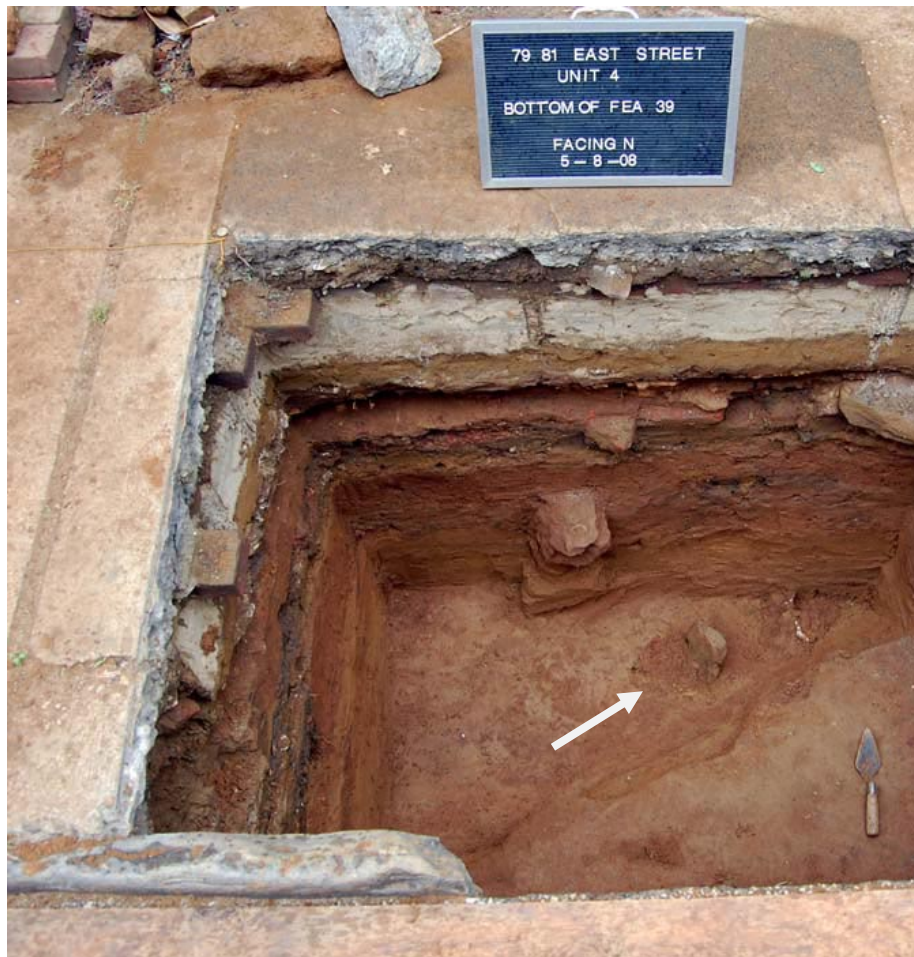
Figure 3. Excavation unit in which the bundle was uncovered. The top of the axe head is visible and still in place.