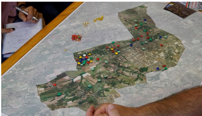
Figure 2. The community mapping method allows us to get information on the spatial aspects of landscape values, problems perceived by locals

The 4 workshops were visited by 144 people altogether. The 1st workshop was organized in 4 local primary schools, with the participation of 102 pupils. Information was gained in the topics of favorite and characteristics sites. The buildings that currently dominate them, such as their home and school, have appeared in large numbers on their drawings, but the natural values of the given settlement have generally been illustrated more times. This suggests that outdoor green spaces play an important role in the lives of young people in the Tápió region. The 2nd workshop was organized for the representatives of local NGO's (10 participants). Information was collected on the values, problems, landscape changes and its locations, mostly relying on the community mapping method (Fig 2.).