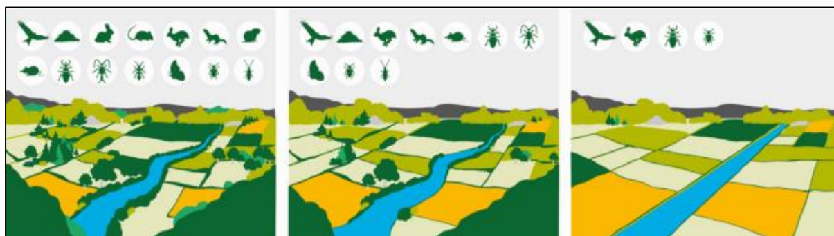
Figure 1. Relationships between land use intensity and biodiversity loss, (ECA 2020)

According to a study carried out by experts from the Hungarian Ministry of Agriculture, the most important interventions for biodiversity in arable land are those that promote the maintenance and creation of close to nature micro-habitats, or in other words biotopes and their connected network. In the same study, it is also pointed out that the indirect effect of the CAP agricultural support received by Hungary in the 2014-2020 period is that these biotopes are slowly disappearing from the agricultural-dominated landscape and this can be linked also to the drastic decline in bird populations mentioned above. (Special Report by Ministry of Agriculture 2020; ECA 2020). Between 2013 and 2020, the total area of woody vegetation categories are decreased by 53% and the area of herbaceous vegetation categories (excluding grassland) by 20% (Special Report by Ministry of Agriculture 2020). Indirect negative impacts on biodiversity linked to Single Area Payment Scheme are discussed in more detail in the next chapter.