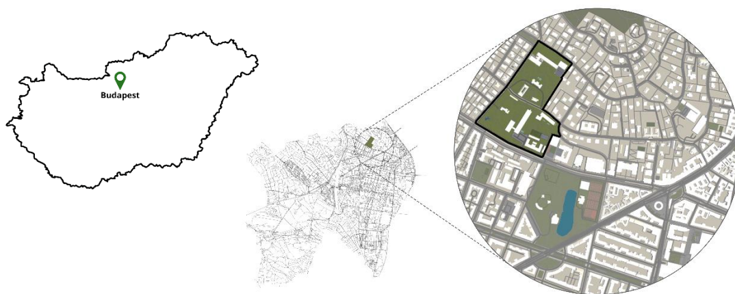
Figure 1. Location of the Buda Arboretum

The phenological phases of taxa are strongly influenced by environmental factors. The vegetation showed different responses to the extreme results of the 2021 weather data. The measures show that the winter of 2020/2021 was 2.5 C° warmer than average. The seasonal average temperature nationally was 2.4 C°, the eighth warmest winter since 1901. The seasonal rainfall total averaged 121.5 mm nationally, slightly above average (1981-2010: 111.3mm). In terms of winter precipitation distribution, January was notable as it was 19% rainier than usual (HMS1 2021). The mild winter was followed by unfavourable spring weather. According to the National Meteorological Service, spring temperatures were 1.9°C lower, the coldest spring since 1987. Temperatures rose day by day in late March and early April, but still remained below average (14.5°C). The spring precipitation total for 2021 averaged 130.3 mm on preliminary data, only slightly below the average for the last 30 years. (1991-2020: 139.4 mm) (HMS2 2021). The mean summer temperature was 22 C°, which suggests that it was one of the hottest summers in the last 120 years, in addition to long weeks with little rainfall. Outstanding in this respect was June, which was measured as the driest June in 121 years. The monthly average rainfall was only 22% of the monthly average, while July and August were 13% and 8% respectively below the previous record (HMS 3 2021).