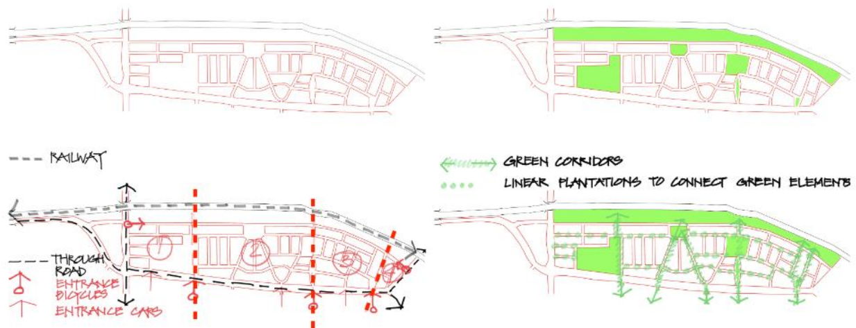
Figure 5. Case study on the city of Utrecht. The images on the left show the interventions in the traffic system and the spatial organisation into four sections for cars. Cars can only enter the neighbourhood at three places from the through road and not get to another section unless they return to the through road. It limits through traffic in the neighbourhood. Bicycles can enter the neighbourhood at any place but there are five entrances to specific bicycle-friendly roads. Images on the right show the existing green spaces in the neighbourhood and how new green connections create a new urban green structure

he plans for the city of Utrecht are just an example, there are many other cities that are planning for new bicycle infrastructure networks, even in Paris and London there are new initiatives. The city of München did already have bicycle networks but has recently taken a new step in extending, enlarging after the Covid-19 lockdowns (Schwarz et al., 2022).