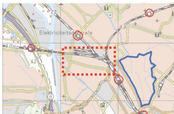
Figure 4. Case study on the city of Utrecht; the neighbourhood that is used as a cases study, located west of the historic centre with the railway in between.

At the structural level, the three networks play a dominant and crucial role (Figure 2). In the green structure plan for the city of Utrecht (Groenstructuurplan, 2007), the plans for new slow traffic networks (Actieplan, 2015), the basic viewpoints for the future development of the city towards 2040 have been used (dichtbij, 2021). All three plans emphasise the need for a structural reorganisation of the traffic network that enables the creation of a commuter network for bicycles but the strengthening of the urban green structure as well (Figure 3).