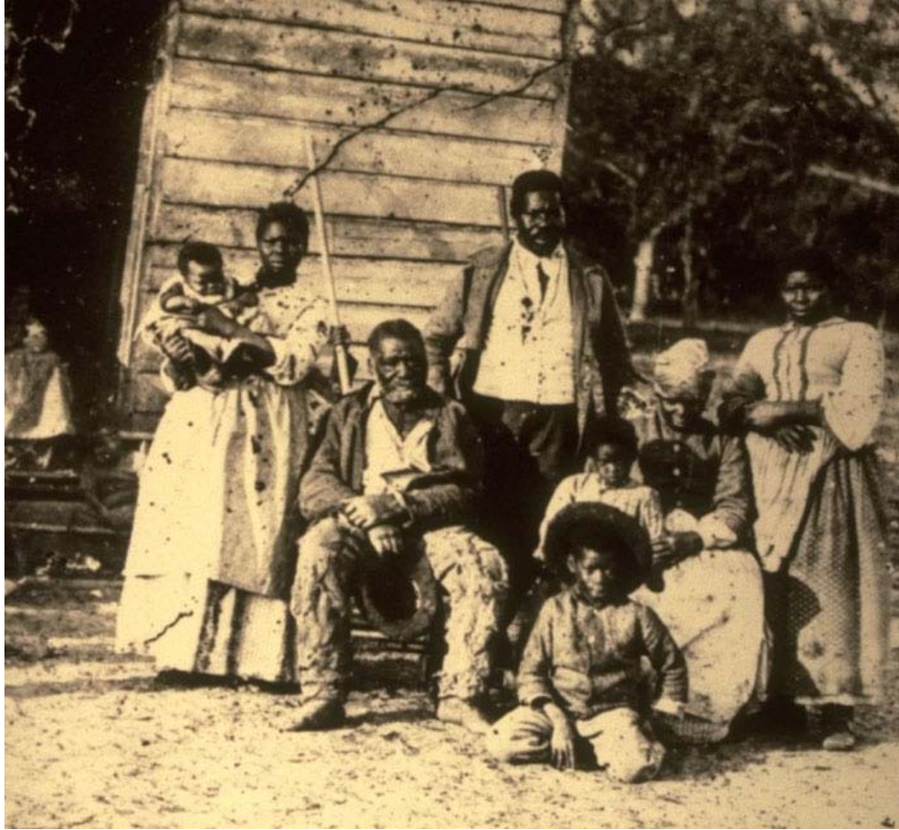
Figure 4. Five generations of an unidentified family on a plantation owned by J.J. Smith, Beaufort, as photographed by Timothy H. O’Sullivan in 1862. Library of Congress, Prints and Photographs Division. Image Reference ‘NW0243,’ as shown on www.slaveryimages.org , sponsored by the VFH and UVL.