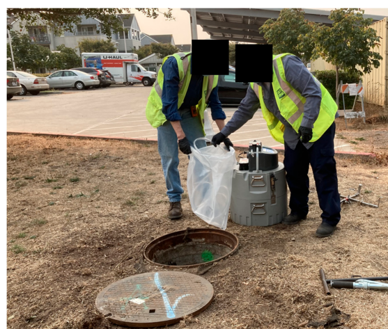
Figure 2. Staff prepare to deploy an automated composite sampler at UC Berkeley.

Δ Different sites sampled at different frequencies, number in table denotes most common frequency across sites. ΔΔ Number of sampling sites varies.