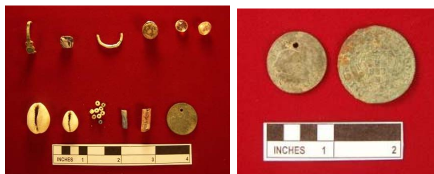
Figures 8 and 9

The kitchen environment was complex, and its liminal nature created a cultural crossroads. The items below demonstrate the intersections of cook and mistress, black and white, and personal aesthetics (Figs. 8 and 9). The top row of Figure 8 consists of an emerald ring, a blue painted jewel, a green glass ring, a mother of pearl button, and two pace jewels. The bottom row of Figure 8 represents African aesthetic adornments; cowry shells, blue, white and red beads, and an English coin turned African by the puncture of a hole.