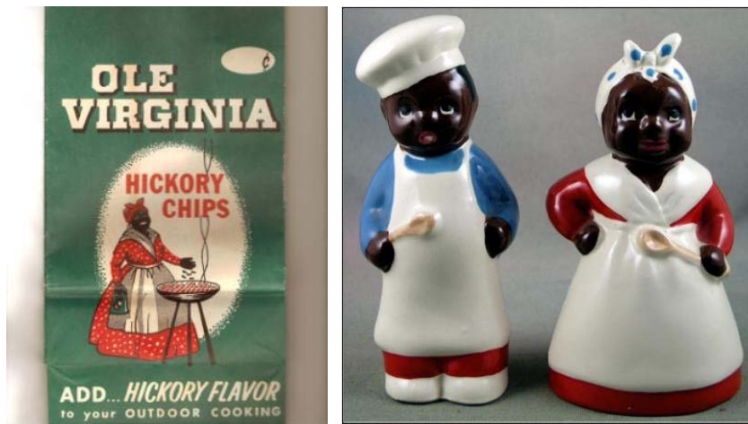
Figure 1. Stereotypes in material culture (all images by author).

While slavery ended over 150 years ago, its legacy permeates our social, cognitive and material worlds. Boxes of Aunt Jemima Pancake mix and Uncle Ben's Rice stock our grocers' shelves, while using the image of enslaved cooks to authenticate their products (Fig. 1). This mythical cook is so engrained in America's culture and consciousness that we have neglected to interrogate this widely accepted memory. My dissertation redefines the mythical "slave cook" and has uncovered their rich and complex history and role in plantation culture. Archaeological data is critical in re-informing contemporary mythical ideas about enslaved cooks and their kitchens, and helps reshape their legacy in America's cultural history.