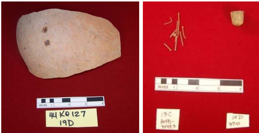
Figures 4 and 5

In addition to an abundance of classic eighteenth century imported ceramics, there was a large colonoware pot sherd, which was excavated from the external kitchen trash pit (Fig. 4). The presence within the kitchen, where pots and pans were readily furnished from the white residents, shows the representation of Black culture within a white space. Whether this colonoware pot was made on the plantation, or given to the cook as a gift from the quarter folk, is debatable. However, its context, as an African derived cooking vessel, locally made by enslaved Africans, shows that the cook, while living in a white landscape, flavored his or her space with material that represented their heritage.