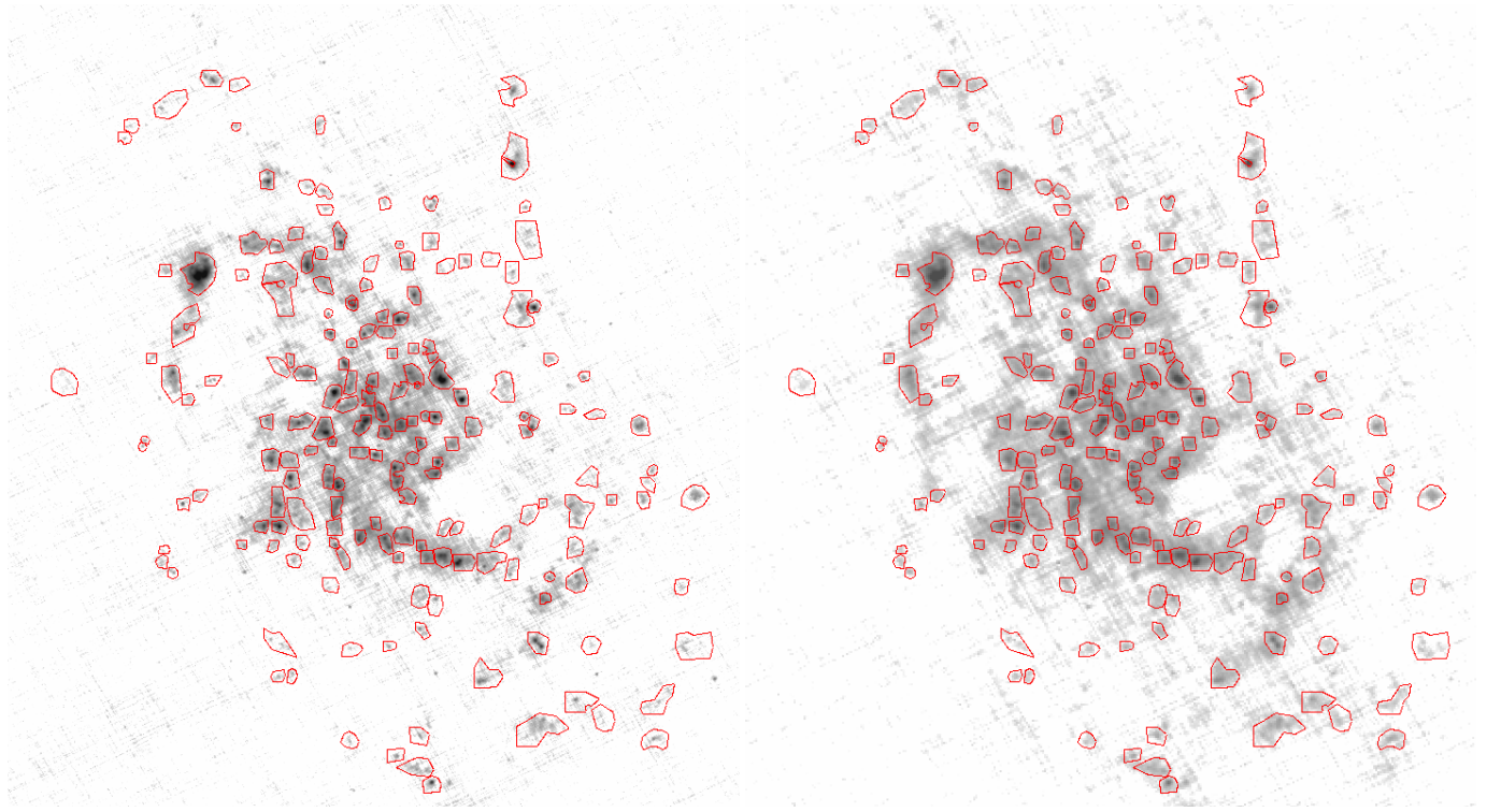
Fig. 1. PACS maps of M33 at 100 \mu\text{m} (left) and 160 \mu\text{m} (right). To probe the full dynamic range of the image a logarithmic scale is used. Individual clumps are well resolved with minimal blending. Some diffuse emission is visible, particularly in the arms and the central region of the galaxy. The visible perpendicular stripes in each scanning direction are sampling artefacts. The red polygons represent the selected apertures. North is up, East is left