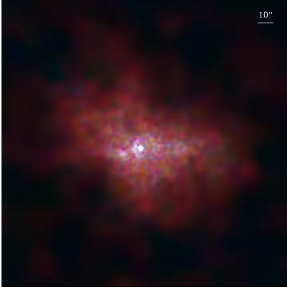
FIG. 3.— Chandra ACIS-S3 image of SNR G54.1+0.3, color-coded by energy: 1.0–2.0 keV (red), 2.0–3.5 keV (green), and 3.5–8.0 keV (blue). The X-ray images in individual bands were adaptively smoothed in identical manner with a Gaussian filter in order to achieve a count-to-noise ratio of \approx 6 in the final 1–8 keV image. North is to the top and East is to the left.

to which these differences are due to different ambient media, energy spectra of the injected pulsar wind (including the time evolution thereof), and ages, among other variables, is not clear.