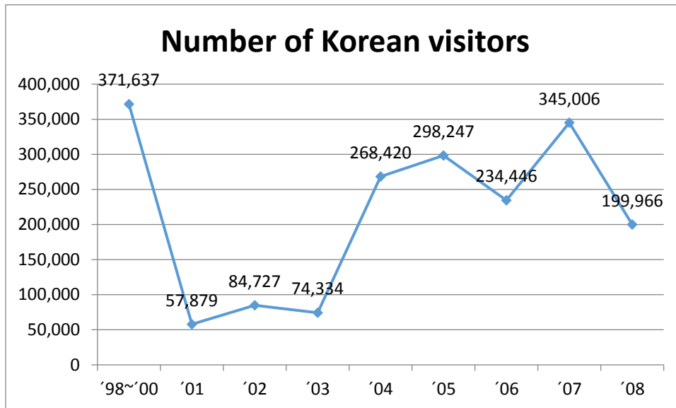
Figure 1. The trends of visitation to the Mt. Kumgang resort