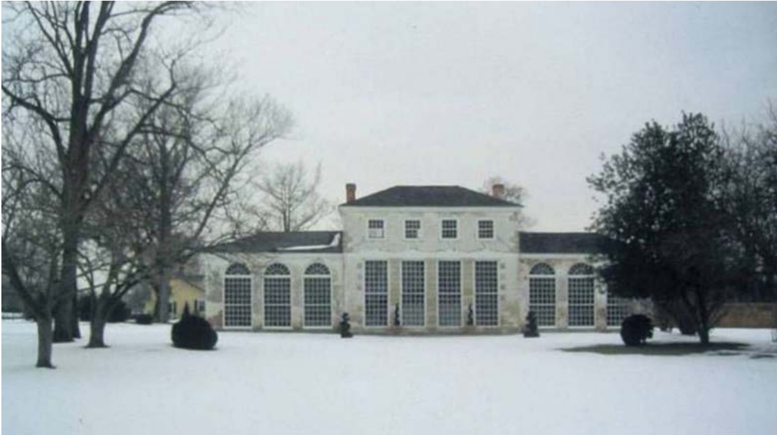
Greenhouse as it appears today ( view an enlarged version of this photo ).

original greenhouse, which did not have a heating system within it. This would have been a garden.