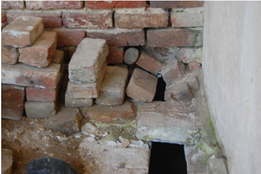
Stone pestle as found during excavation (view an enlarged version of this photo ).