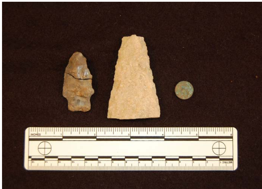
African charms buried at doorway to greenhouse living quarters. In West African practice, placing metal and pointed objects at the doorway helps deter harmful spirits from entering. These were found buried at the entrance to the slave quarters, until now known only as a potting shed – its most recent use (view an enlarged version of this photo ).