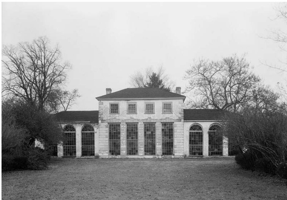
Part of the Library of Congress Collection of the Orangery. Because of its age and uniqueness, the Orangery has been frequently photographed, but, until now, never systematically examined by archaeologists (view an enlarged version of this photo ).