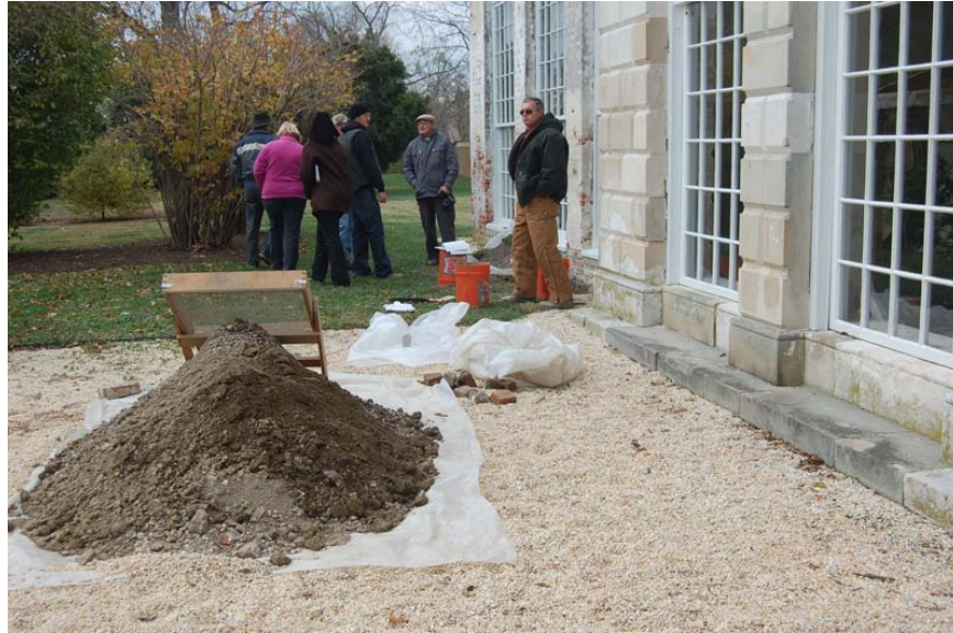
Team at work at the greenhouse (view an enlarged version of this photo ).

Return to March 2011 Newsletter: http://www.diaspora.uiuc.edu/news0311/news0311.html