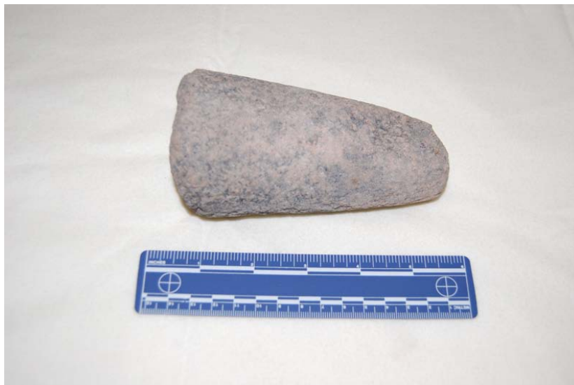
Evidence of African Spirit Practice – Stone Pestle Hidden in Greenhouse Oven. This prehistoric pestle was found cemented among the bricks at the back of the furnace. Leone identifies it as an African charm put there by the slave who built the furnace (view an enlarged version of this photo ).