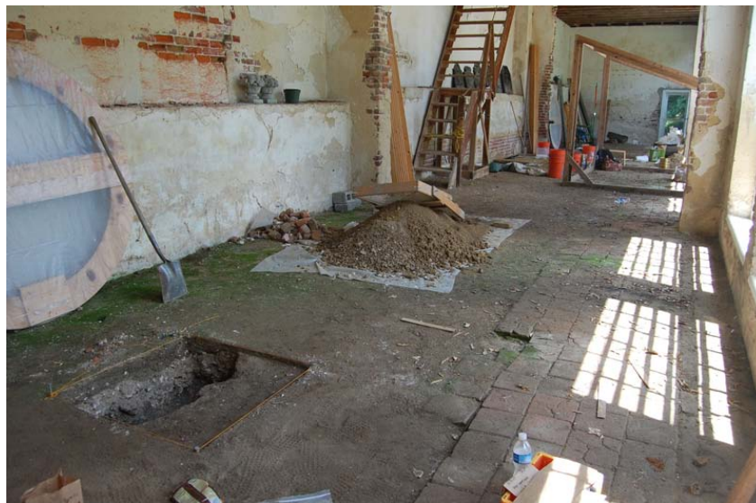
Greenhouse interior under excavation (view an enlarged version of this photo).