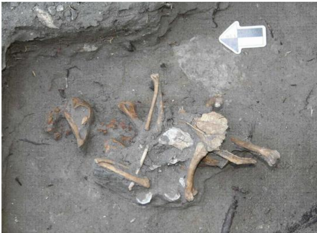
Feature 4, consisting of an articulated chicken (hen) with egg and associated objects, buried under the floor of Cabin W-15 at Kingsley Plantation

analysis will be completed in the Fall of 2006, and the results will aid in the interpretation of this feature. Beyond the egg, the artifacts associated with the hen are also very interesting; a glass amber-colored seed bead (perhaps one of several; since the associated float samples have not yet been processed), and a very odd object that is probably a natural concretion with irregular surfaces, approximately 5 to 6 cm in length and 2 to 3 cm in thickness. It is a mottled brown in color and likely a piece of ferruginous sandstone, a type of concretion or precipitate often formed in latteritic soils subjected to rapid episodes of wetting and drying. This concretion was placed beneath and in alignment with the chicken and the adjacent wall.