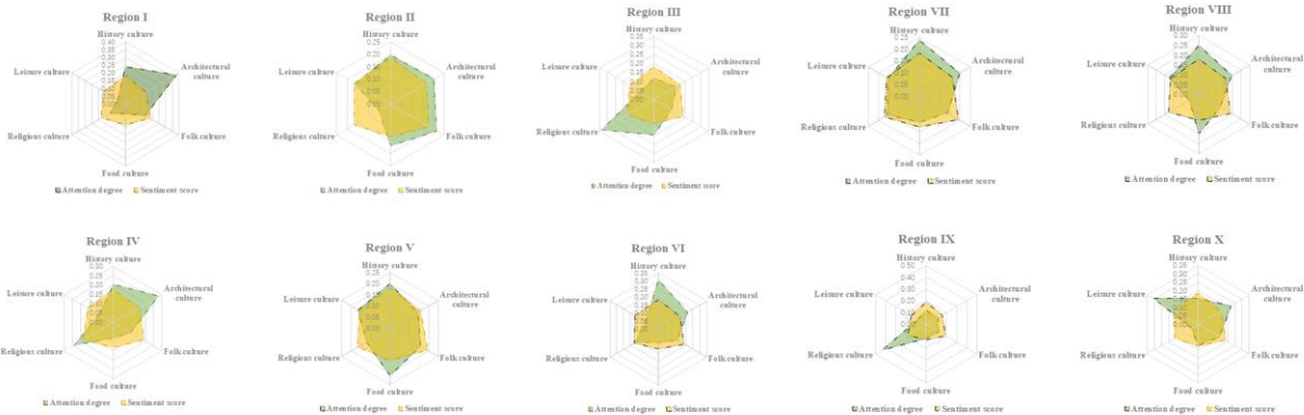
Figure 3. Differences in cultural perception dimensions and tourists' emotional evaluations in different cultural tourism regions