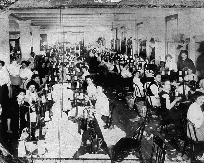
24. A shop floor in a New York garment factory.

fall, Triangle's owners struck back aggressively. Pickets were verbally and physically harassed by hired thugs and the police, and dozens of strikers were arrested. To add insult to the injury of incarceration and fines, the arrested women were taken to Jefferson Market Courthouse at Sixth Avenue and West Tenth and tried in Night Court, a tactic meant to intimidate strikers through association with the prostitutes whose cases usually filled that court's dockets. "No nice girls go there," one arrested shirtwaist maker asserted. 48