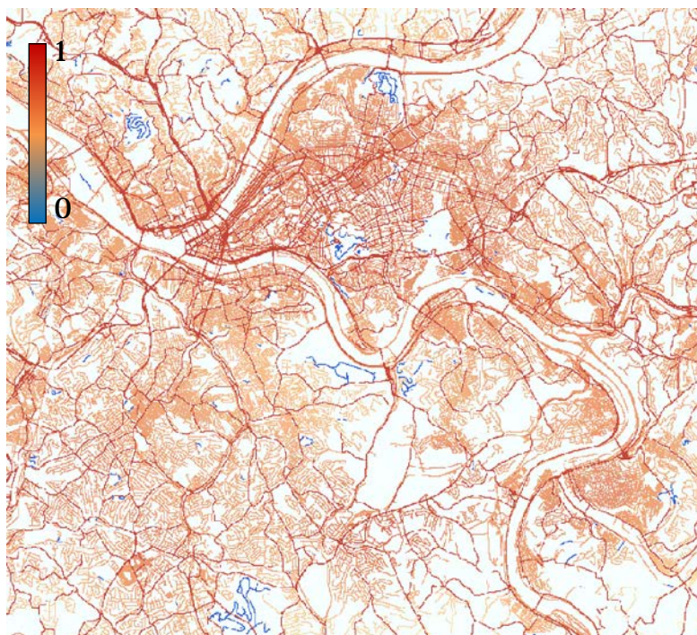
Figure 1. The traffic settings variable, in the Pittsburgh area. Blue areas (very low traffic) are in parks and other protected land, while expressways show the highest traffic. Note that depicted values are the probability of an animal being killed while crossing the road, not raw traffic rates.

Traffic contains a value between zero and one for each road cell, representing the probability that an animal will be killed crossing the road. Since species vary greatly in their road-crossing behavior, this probability must be interpreted in a general sense. In general, extremely low-traffic roads (e.g., gated roads through protected areas) will have near-zero mortality for most species, while extremely high-traffic roads such as expressways pose very high mortality risks for all terrestrial species (or conversely, will represent a barrier for species that are able to assess the danger and thus avoid crossing).